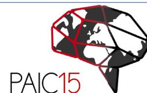
FIGURE 3 The PAIC15 scale