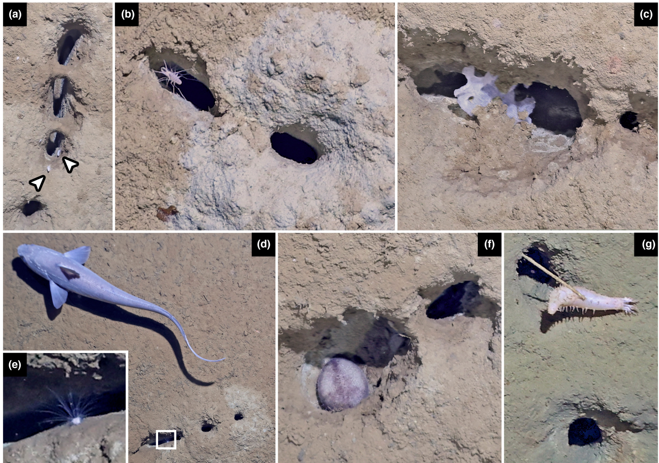
FIGURE 3 Fauna associated with burrow openings. (a) Munnopsid isopods (arrowheads), (b) Desmosmatid isopod, (c) Glass sponge, (d) Giant Grenadier, the main potential local predator, with inset (e) probable long-spined aspidodiadematid urchin, (f) Irregular urchin (possibly Cystechinus sp.), and (g) Holothurian, Abyssocucumis .

colleagues (Buhl-Mortensen et al., 2016) observed the deep-water unciliid Neohela monstrosa also using gnathopods and antennae to shovel out sediments from burrows in the Norwegian and Barents seas. These burrows seem to be much smaller and less structured in placement, but they support the same basic use. Apart from N. monstrosa , all documented burrow-making amphipods are from relatively shallow waters, but this most likely represents a significant sampling bias.