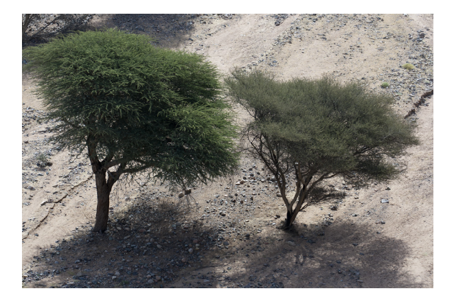
Figure 1. Acacia tortilis (Forssk.) Hayne supsp. raddiana (Savi) Brenan (left) is the dominant of the two subspecies of A. tortilis in the study area; subsp. tortilis is seen to the right.

According to Kyalangalilwa et al, 2013 the newly formalised official name for Acacia tortilis is Vachellia tortilis (Forssk.) Galasso & Banfi.