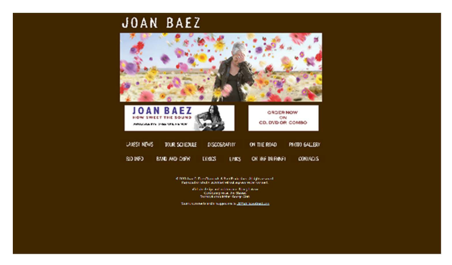
Fig. 7: Joan Baez' official website

The exemplar of website as text is the official website of the artist Joan Baez.