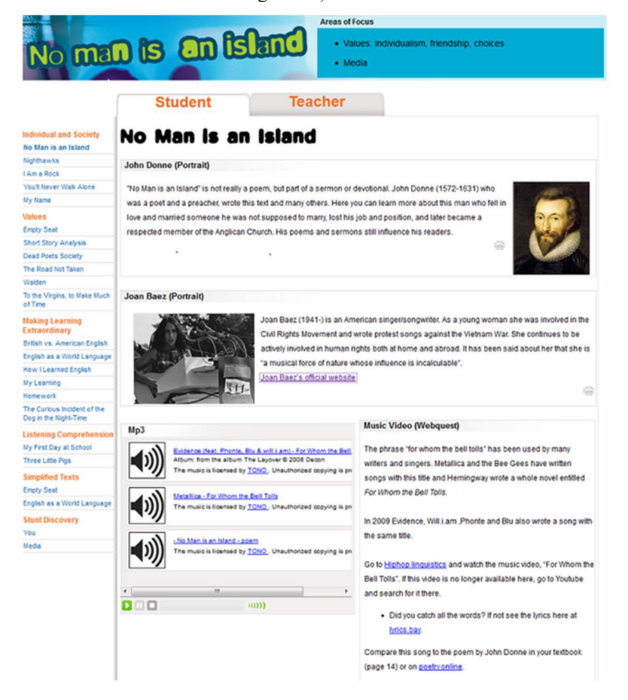
Fig. 3: Screenshot illustrating surface level and hyperlinked level

The hyperlinks rendered in the educational websites branched into internal links , that is, ancillary material furnished by the publishers themselves (separate audio files and summaries, reference material and links to other sections of the website), and external links leading directly to other Internet sites. The present study focused on the web-based hyperlinks, which means that the hyperlinked level was restricted to sites or texts on the Internet accessed by links provided in the EFL educational websites. Links leading further from these connected Internet sites, however, were not included in the study (for example, a New York Times article accessed by a hyperlink in the Stunt website was registered on the hyperlinked level; but the links rendered in the New York Times article itself were not registered).