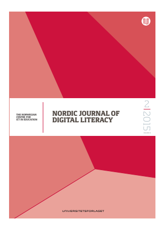
Nordic Journal of Digital Literacy, volume 10, no 2-2015 p. 102–120 ISSN online: 1891-943X