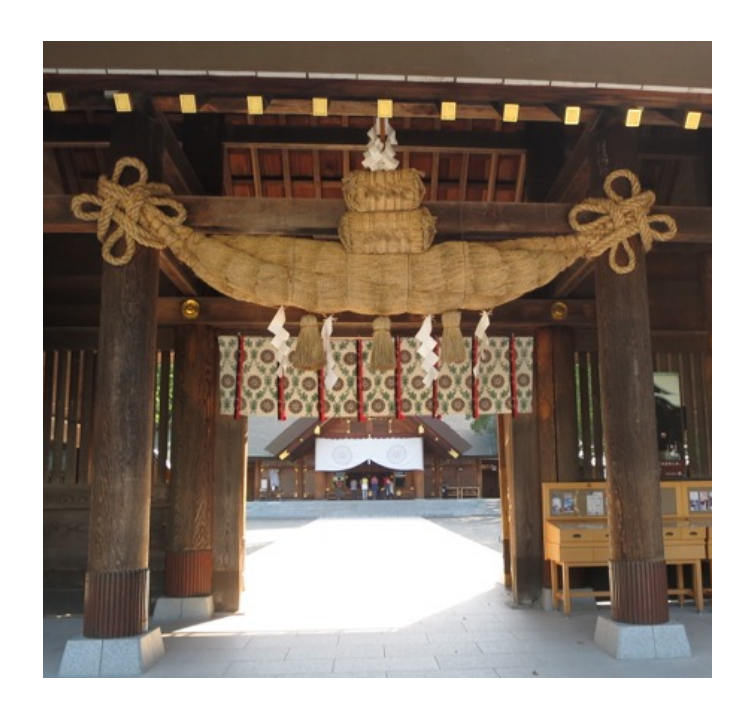
Fig. 5.

On the inside of this entrance there was a big open space, like at the Meiji jingu , but with more trees. When we were inside this structure we saw a ceremony with people inside the haiden where they sat on benches and the Shinto priest was chanting and beating a drum. Every shrine I visited had an ema station and a place to tie one's notes of 'bad luck'. At the shrines I visited they had a dispenser of some sort that gave the visitor a paper that told if one was lucky or not. One could get a couple of different ones and I was shown by informant A that if one got one that said one had bad luck one would tie the paper to these stations and so one would leave one's bad luck at the shrine, whereas one brought home the notes of luck and one kept these till the end of the year to remain lucky. Informant A explained that when praying she often prayed for everyday things and that most people did the same. We took a look at the emas at the shrine and I observed that the form of these varied, some were in the shape of a popular culture character (cf. fig. 6).