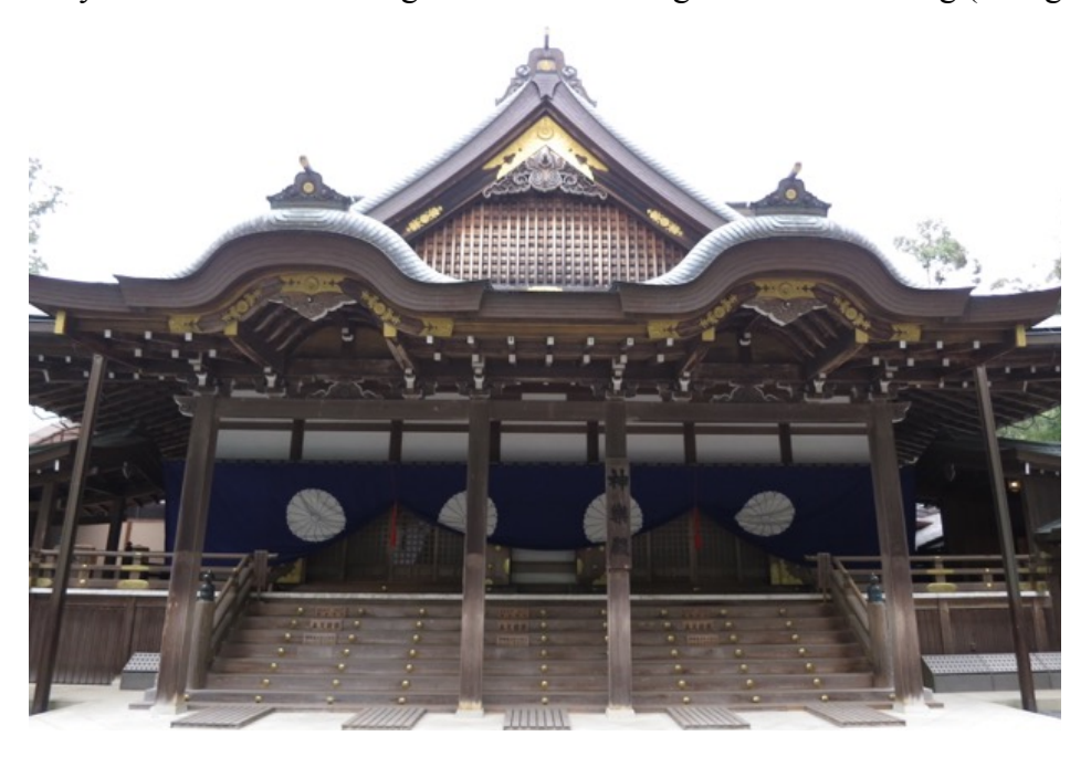
Fig. 7. The entrance to a ceremony house at the Naiku jingu. Photo CF.

The colours of the area were mostly natural with sometimes parts of the roof or building being white or gold. The emperor's seal was mostly in gold. An example of this was what seemed to be a ceremony house, where people booked ceremonies. Which ceremonies were done was something I could not observe because it was all hidden by heavy purple curtains but I could every so often hear chanting and drums coming from that building (cf. fig. 7).