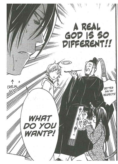
From left: Yato, Yukine, Tenjin, Hiyori