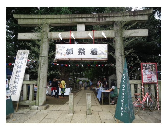
Fig. 9. The torii at the entrance to the Hato no Mori Hachiman jinja.