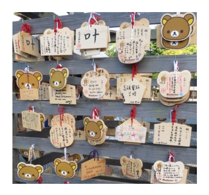
Fig. 6. Photo CF.