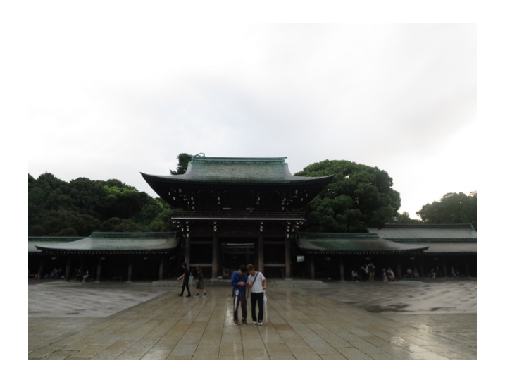
Fig. 2. Photo CF.

one switches hands and pours a little water into one's cupped left hand, rinses the mouth, and spits it out; one should not swallow the water. One finishes the ritual by letting the remaining water pour down the handle of the ladle and places it back on the temizuya face down. After this one can enter the main shrine structure. The shrine structure at the Meiji shrine is a big open wooden square. When standing in the middle and looking at the main entrance it looks like on fig. 2.