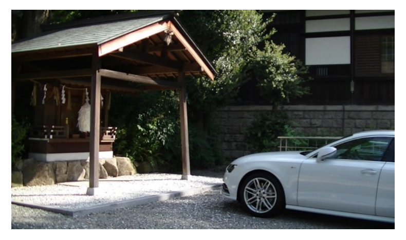
Fig 10. Photo CF.

empress and the three sea Kami, were kept in the natural, with none of the orange colour that the bridges, fences and smaller structures were painted with. When she showed me around, informant B showed me a power centre connected to the shrine and how it worked compared to at other shrines. She presented it as a holy place to gain strength and power or learn that one needs to gain more. As mentioned earlier, informant B was the only one who explained and showed me a power centre. If there were any power centres at the other shrines that I observed, except for at the Ise Naiku jingu , then I did not see them because I did not know of them. We also saw a car parked in front of a smaller shrine and informant B told me that the car was about to be blessed. This can be seen in Fig. 10.