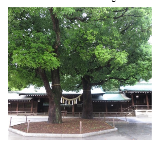
Fig. 3. Photo CF.

When entering the square structure at the Meiji shrine from the main entrance one has benches to the left and right under the roof. The ground is covered in white stone as one can see on fig 2. To the right one has the opening to the alternative entrance or exit, the shop where one can buy an ema , <sup>166</sup> a prayer plaque, that one can write one's prayer or thanks on, and a sacred tree surrounded by a structure that holds the ema . To the left of the main entrance there is another exit and two sacred trees tied together with a holy rope (cf. fig. 3).