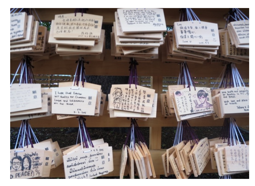
Fig. 4. Photo CF.

On fig. 4 one can see that some of the emas have drawings in addition to the text, and two of these are Japanese drawn in the manga drawing style. This shows that the manga style is used, even on prayers at shrines. When I was shown around at informant A's shrine, she told me that prayers made at shrines are taken very seriously by those who make them, especially by the Japanese. This suggests that the Japanese prayers are serious. However, whether the tourist prayers and thanks are serious, is something I cannot know.