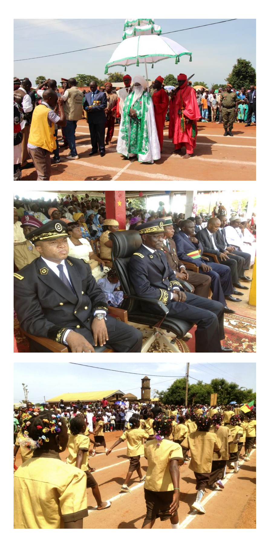
Scenes from the National Day celebration in Djerem, 2013. Top: The Lamido of Tibati /Middle: The Sub-prefect (left) and the Prefect /Bottom: School children marching and singing