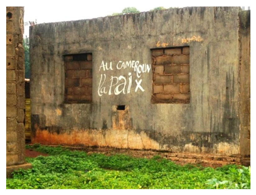
Unfinished house in Tibati with painted text: "Au Cameroun la paix" (English: "In Cameroon peace").