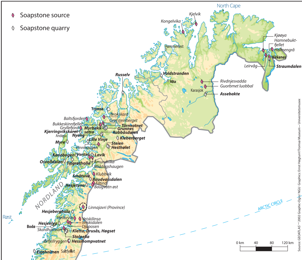
Figure 4. Map of northern Norway with the distribution of soapstone sources and quarry sites. (Graphics: E. Høgtun, Tromsø University Museum).

Sør-Varanger), although there are historical references to potential quarries near Alta and Karasjok. Although lacking evidence for quarrying, human activity at the soapstone exposure on the island of Kjøøya in Sør-Varanger was documented by NGU in 2013. A series of inscriptions interpreted as ownership marks ( bumerker ) have been cut into the soapstone with at least three, and possibly up to five, different designs partially superimposed upon one another. The most distinctive design is a ‘knot’ or valknute with three arms and loops on the ends. It is possible that the inscriptions are associated with the Pomor trade carried out between northwest Russia and northern Norway from c. 1740 up until the Russian revolution in 1917.