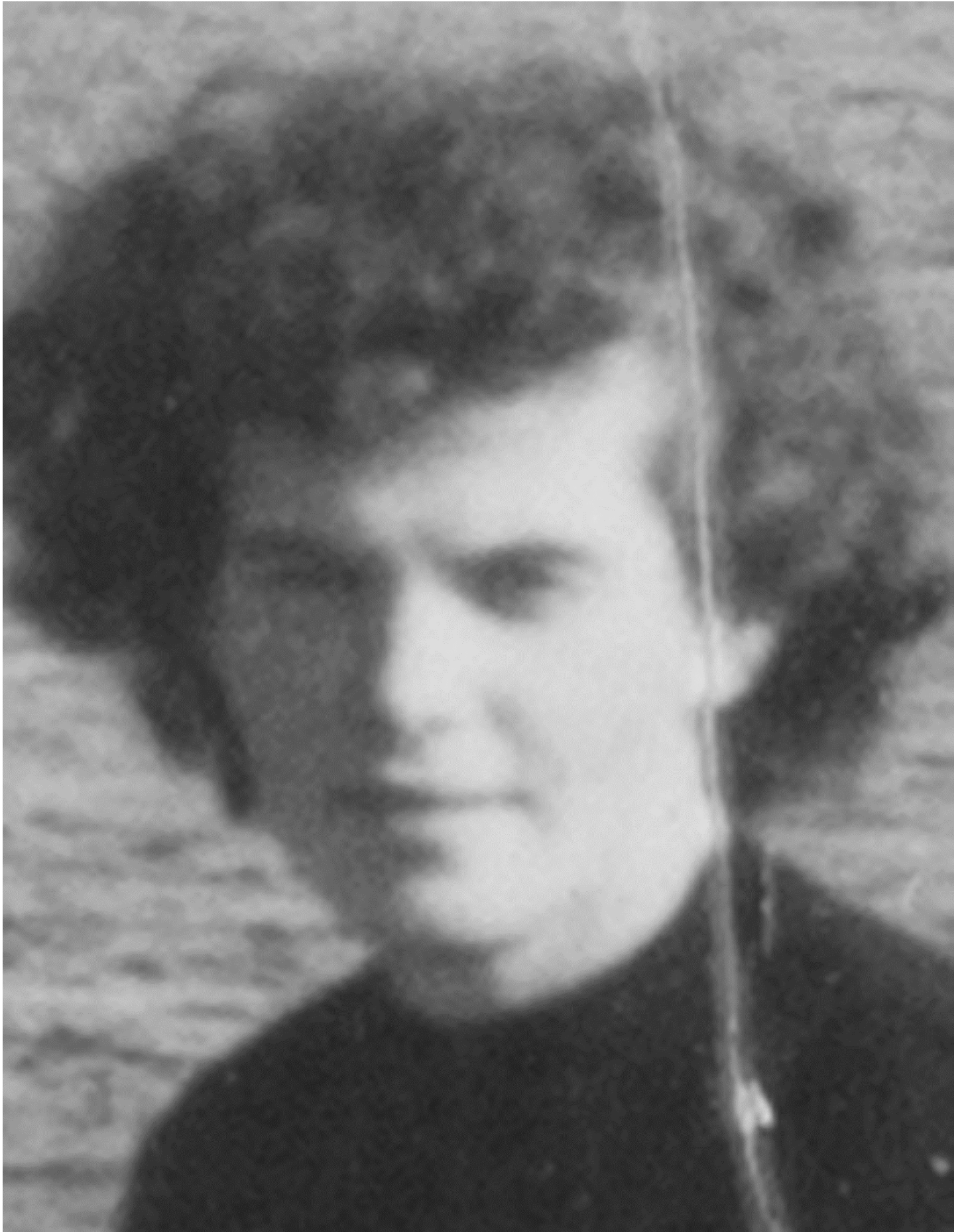
She really looks substantial when she's blown up