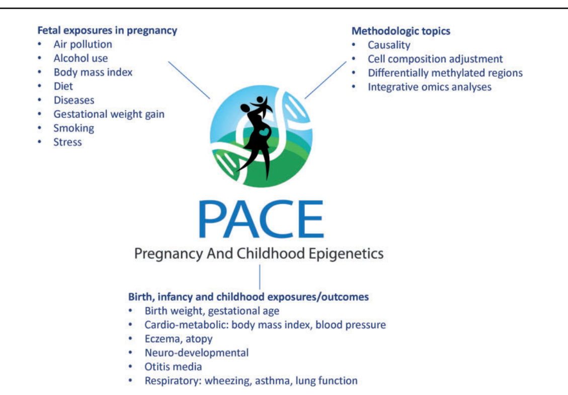
Figure 3. Current main exposures, outcomes and methodological topics in the PACE Consortium.

metabolomics if available, creating the possibility for integrative omics analyses. The availability of GWAS data enables analyses of associations of genetic variants with DNA methylation, as well as analyses to assess the potential influence of genetic variation on methylation variance, the possible causal role of DNA methylation differences using a two-step mendelian randomization approach, and adjustment for genetic markers of ancestry.<sup>36–38</sup>