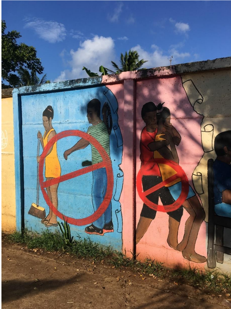
Figure 6: Murals on a school wall showing that machismo is prohibited.

“Only if he wants to,” a couple of the students agreed, before the next group prepared their presentation and discussion about women working outside the household.