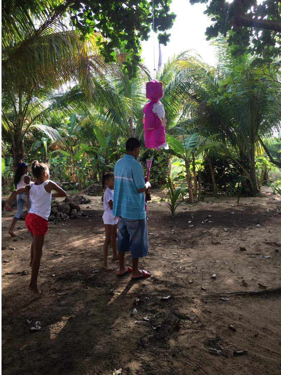
Figure 7: Man playing with the children during a 7-year-old girl's birthday party.