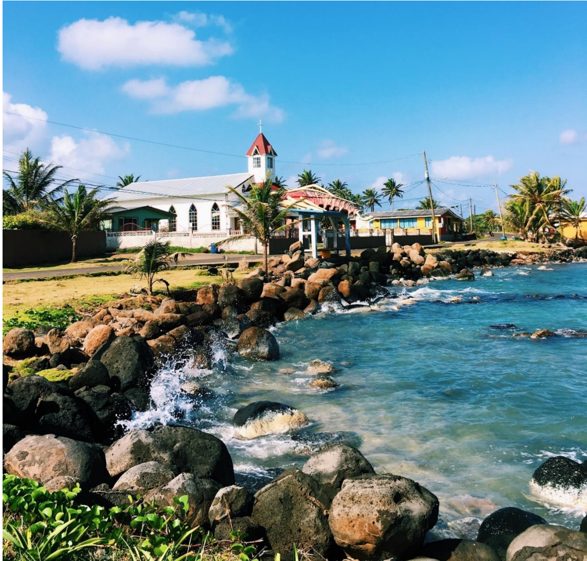
Figure 4: One of Maracuyá Island's 14 churches.