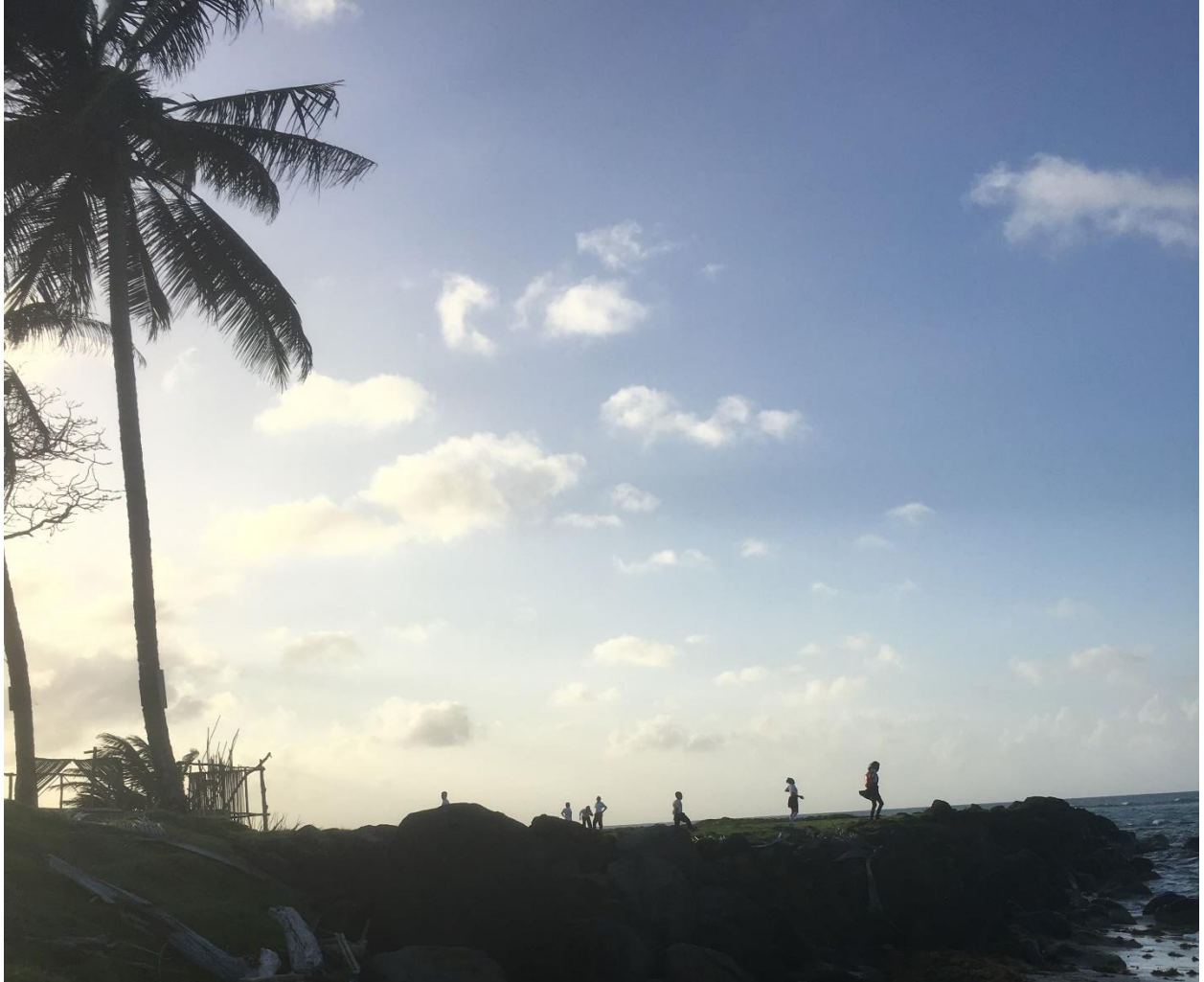
Figure 3: Teenagers hanging out after school.