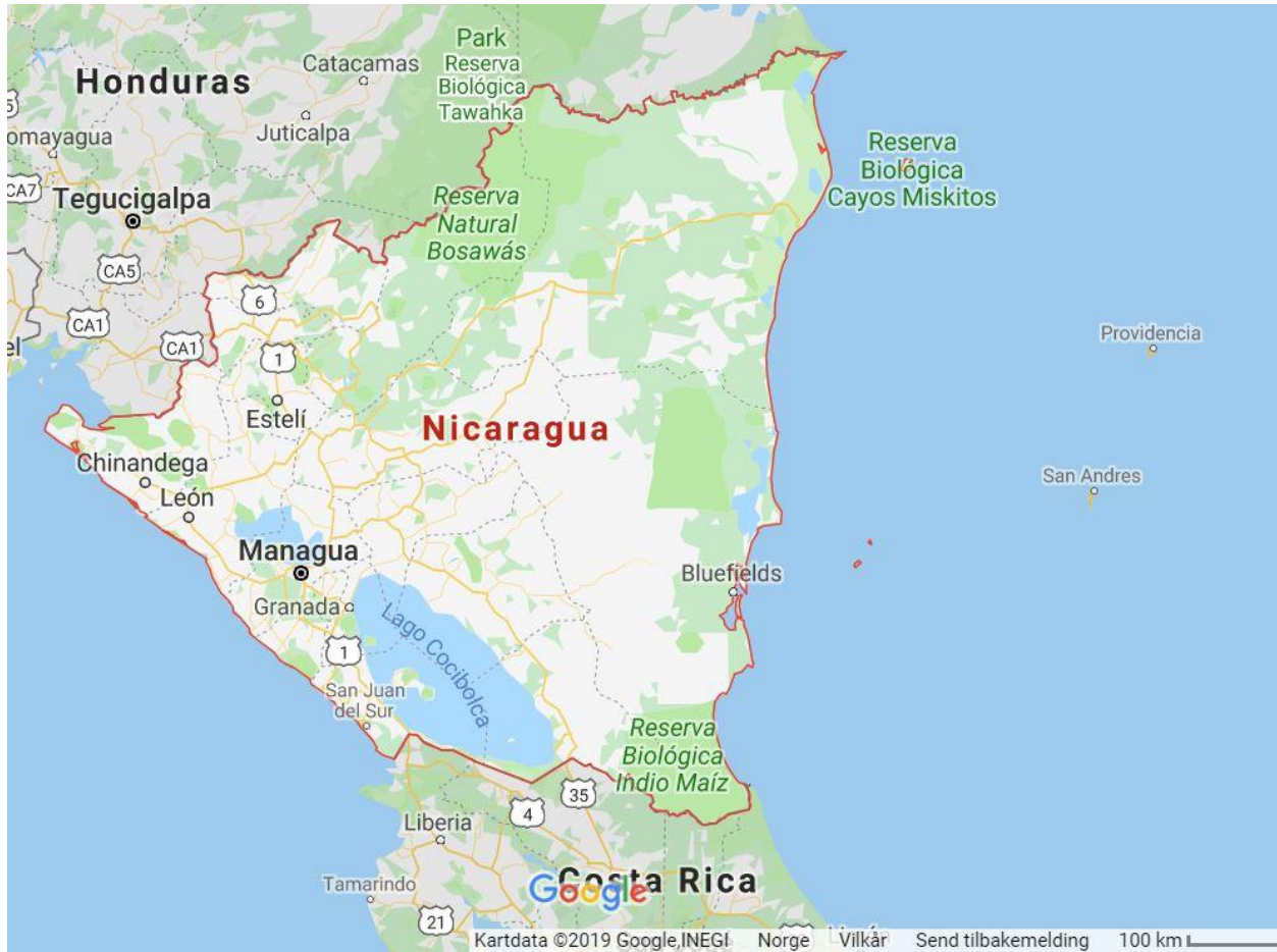
Figure 1: Map of Nicaragua retrieved from Google Maps.