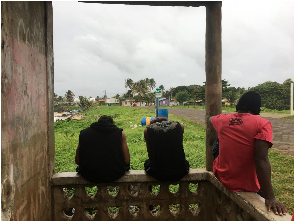
Figure 5: Young men hanging out outside an abandoned building named “Five Star Hotel”, while students are walking home from school.