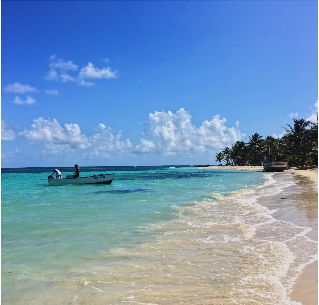
Figure 2: Two young fishermen on Maracuyá Island preparing their panga and fishing equipment.