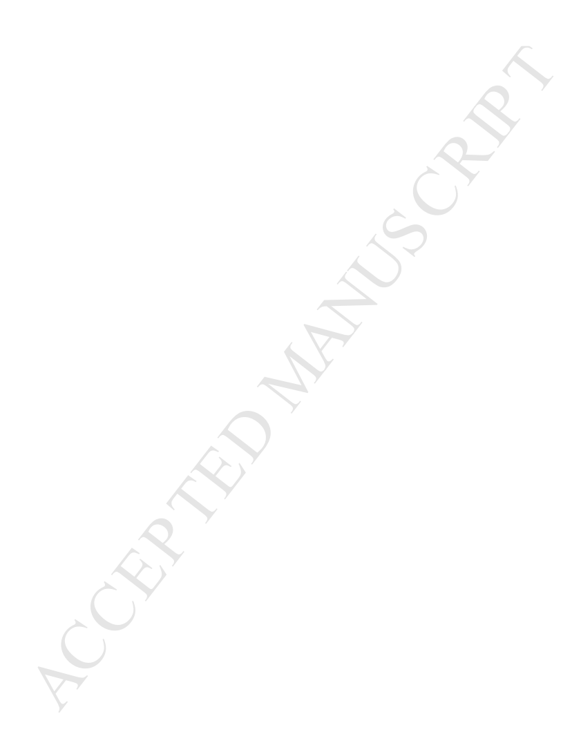
Fig. 2. Description of the activity system based on our findings.