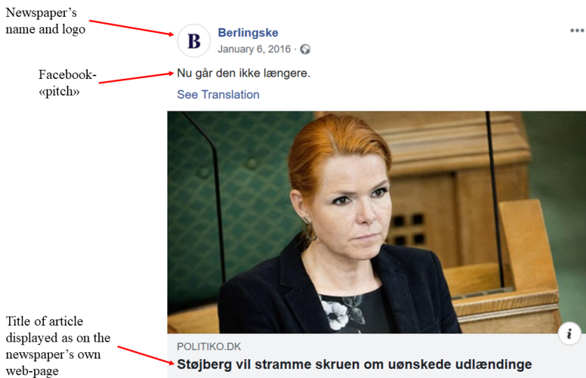
Figure 4: Facebook post as it appears for the users The post is from Berlingske (Jan. 6, 2016). Clicking on the photo or title of the article will re-redirect the user to the article on the newspaper's own web-page.

Independent of how the user accesses the post, it will contain the newspaper's name and logo, the main photo used in the newspaper article, the title of the article, as well as an additional introduction – a "pitch", as described in the figure below.