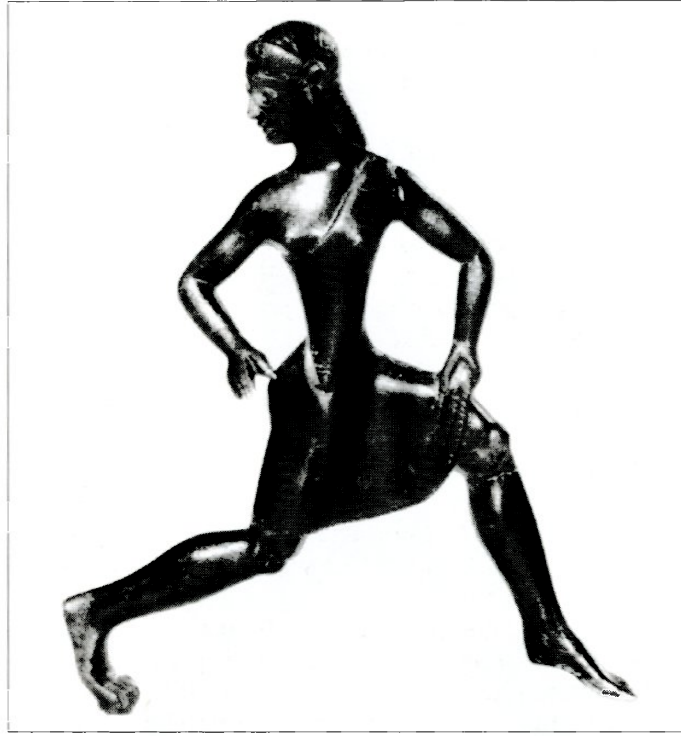
Fig.4. Bronze figurine from about 540 B.C., found in Albania, exhibiting the dress and hairstyle of the athletes at the Heraia, as recorded by Pausanias. Height about 11 cm. left leg has been restored. British Museum Bronzes no.208.

magistrates responsible for both games, the Sixteen matrons and the nine Hellanodikai, purified themselves with the blood of a piglet and water of a sacred spring (Paus. V 16. 8). There are, then, striking parallels between the male and the female celebrations (Scanlon 1984). Since the temple for Hera was built as early as approximately 600 B.C. the conclusion seems inevitable that some cult involving women existed at an early date. Sources that show female participation in footraces in several parts of archaic Greece strengthen the possibility that the Hera-races as recorded by Pausanias are part of a general tradition and date from an early period. Pausanias mentions that "the Eleians trace the maidens' games to ancient times" (Paus. V 16. 4). The Heraia were probably reorganised about 580 BC (Scanlon 1984, 86). This is not to say that the female games remained a copy of the male games. It seems more likely that, while the Heraia preserved the characteristics of local initiation rites, the Olympia evolved into a celebration of a more