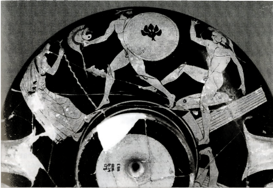
Fig.2. Vase painting on drinking cup from Athens 500-470 B.C. Male armoured athletes participate in sprinting, the last exercise in the Olympic Zeus games. (British Museum vases E818)

8, 6). Other branches of athletics were introduced as time passed by, such as boxing, wrestling, horse chariot driving, horse race, combined athletics (the pentathlon ), and an armed race. After the reorganisation of the games in the 77th Olympiad (472, Paus. V 9, 3) the whole program lasted for five days (Paus. V 8, 6-11). The arrangement committee, the Hellanodikai or Hellenic arbiters, was recruited from the nearby city of Elis, (Paus. V 9, 5). The winners were honoured abundantly both in Olympia and at home. At the games they received a crown from the wild olive, Zeus' sacred tree. In early times participants seem to have been recruited in particular from aristocratic families and in their honour a victory song was composed by the greatest poets then living (among whom Pindaros). Winners had the right to erect a statue or other monument in Olympia in memory of their victory, and in their home-city they were honoured with substantial material rewards.