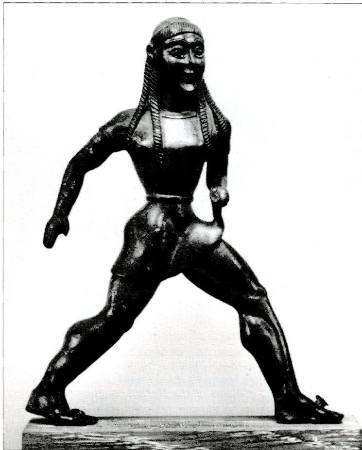
Fig.3. Female athlete from about 560 B.C. Bronze figurine. 11.7cm high. found at Dodona. Epiros. (Athens National Museum, Carapanos Collection 24)

slaughtered on this occasion. and after the bones were burnt at the altar of the god, the meat was consumed by the participants at a joyous celebration.