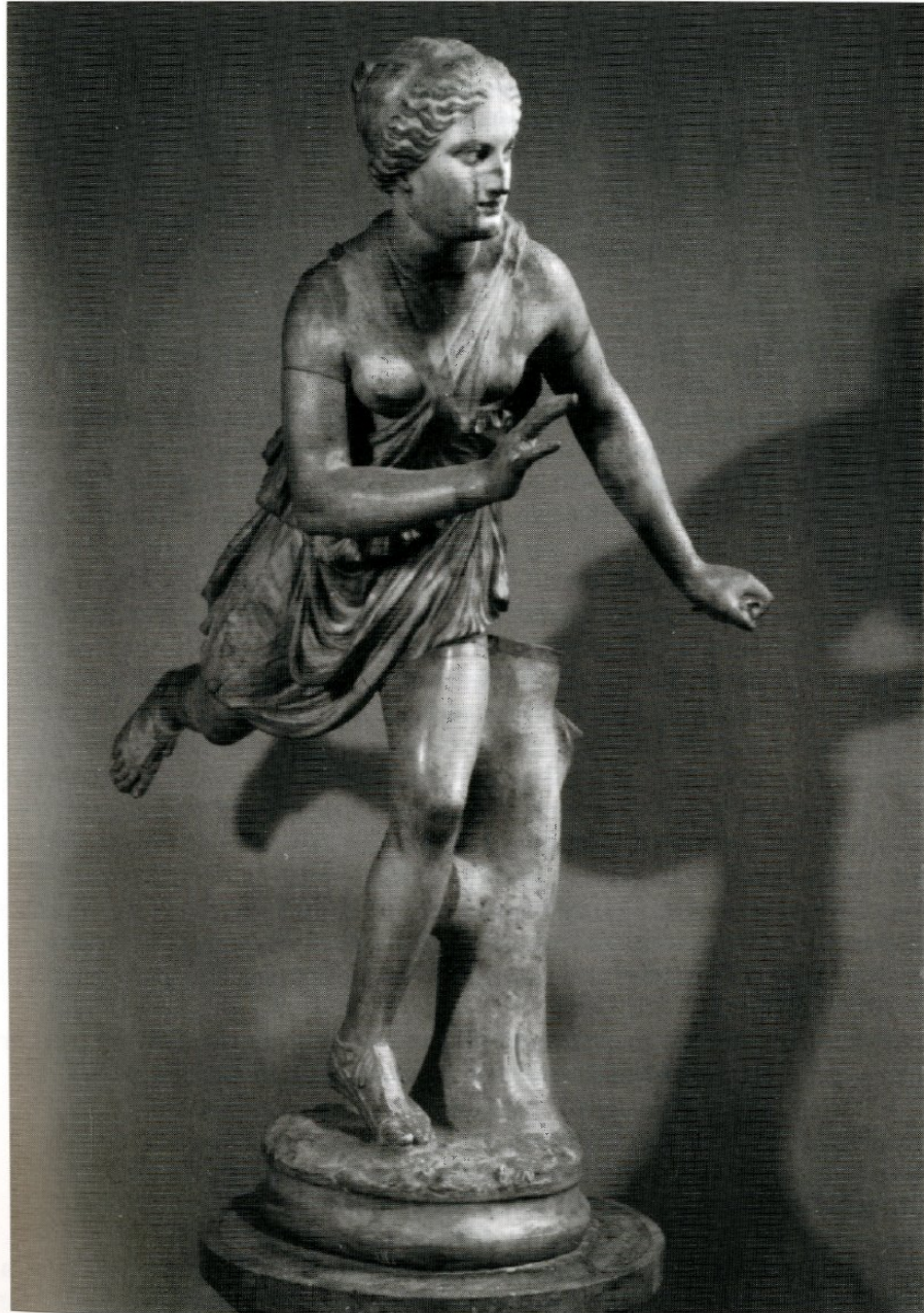
Fig.5. Marble figure of girl dressed as an athlete. Original, or copy, of the classical or early hellenistic period. Height 124cm. (Paris, Musée du Louvre MA522)