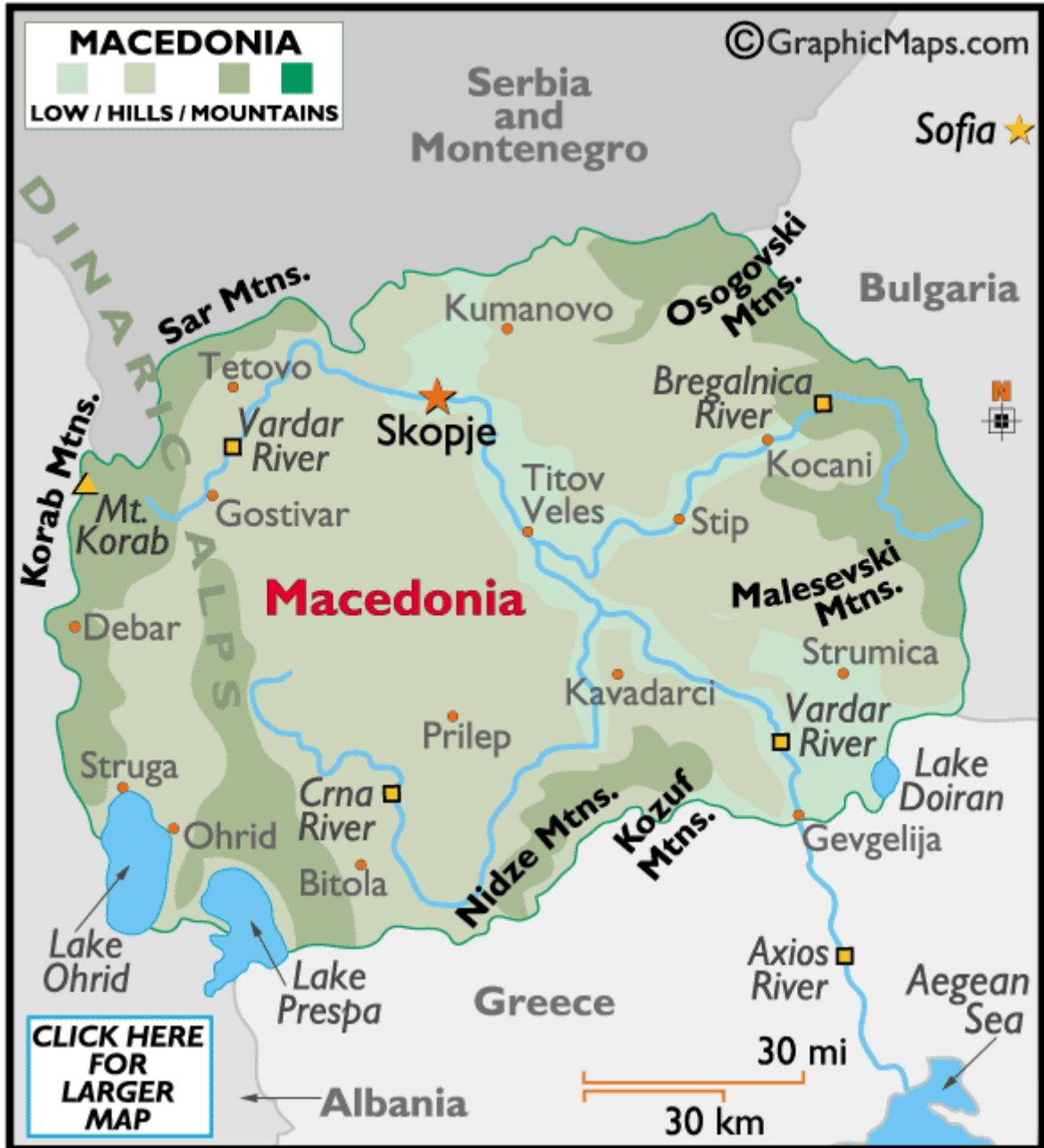
Map of Macedonia showing the surrounding countries.