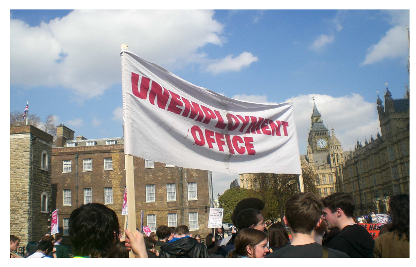
Figure 1: Unemployment Office banner being held