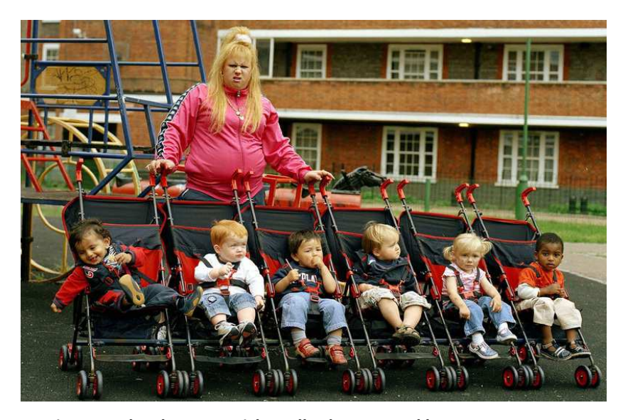
Figure 8: The character Vicky Pollard, portrayed by actor Matt Lucas

clothing, associated with lack of interest in dressing properly and a "no care" attitude. Such stereotypes have in common a construction of benefit dependency, into a form of moral panic. Chavs has become a cultural symbol, often portrayed as "what is wrong with Britain today" by commentators in the media, but also by people who are worried about the economy. It is a daily conversation topic for many, not least because of its prominence in different Media. It is the work ethic, moral character and motivations that are seen as in deep decline, forming a sort of moral panic in the media and among politicians. There is reinvention of these kinds of moral panic and their stereotypes which stand in contrast to other stereotypes that has been around for a while such as "welfare mothers". It is interesting to note that this caricature of Chavs is also very much evident among the working class themselves. The pride in work and social justice is perceived as threatened by parasitic forms of welfare. When such notions are subscribed to be the unemployed as well, it becomes similar to Gramsci's conceptions of hegemony. This was indeed pointed out by some of the activists, who stressed that the ideas and norms of the working class are reproducing the conditions of their own domination. That is, those who are demonised and caricatured are also appropriating and using the same stereotype and language that demonised and caricatured them.