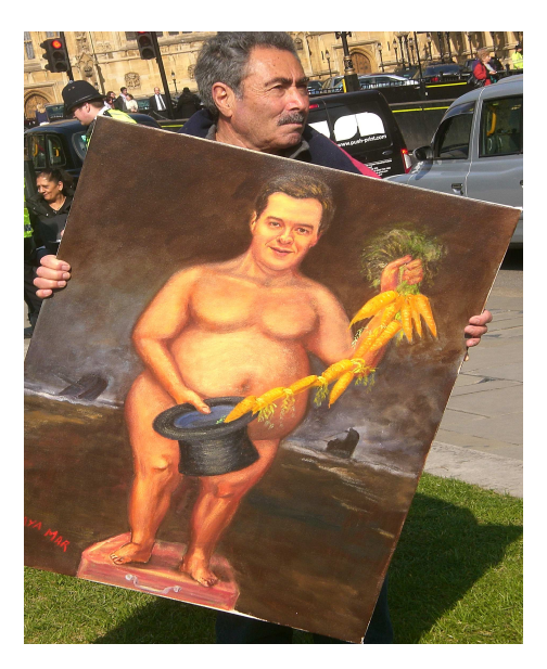
Figure 3: A satiric painting of Chancellor George Osborne

were claiming at this protest that his lies had been exposed. Pulling out carrots from a magician's hat also conjures the image of the "trickster", who is creating illusions. For the activists, austerity was the biggest lie.