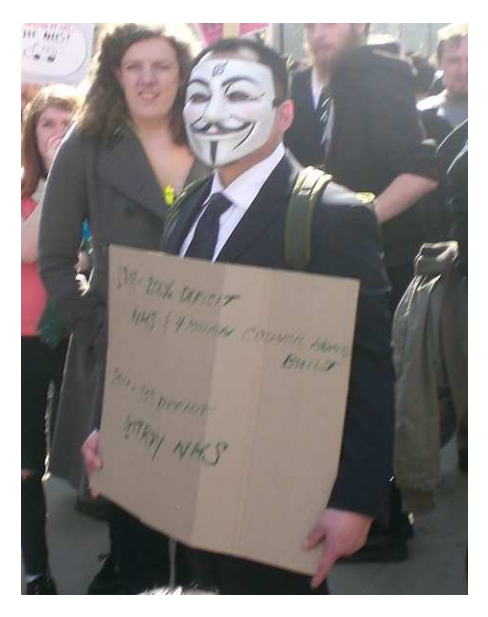
Figure 4: Protester wearing a Guy Fawkes mask

The wearing of any mask is itself a sign of intent. The bearer is (to a degree) anonymous, and free to transcend some boundaries set by society and no longer recognisable on CCTV. As such, it is similar to the hoods and scarves that many wore in the Riots in 2011 in order to stop being identified. Some of the activists were suspicious of the methods of surveillance that were used by police. Police surveillance was said to have become stricter as the summer Olympics were closing in. It is interesting to note that the new electronic methods of surveillance were also taken up by the activists themselves. With modern technology, such as mobile phones with cameras, any injustice by the authorities could be documented and posted online as it happens. This is especially the case with video-streams show footage as it is recorded live. The low cost of phones, cameras and internet connections has democratised who can bring forth objectified forms of truth. The internet offers a new arena where meanings can be interpreted and conveyed. It provides alternative methods for releasing information that is not subject to the same controls and editorial policies as the mainstream press. I suggest that this could be described as a kind of democratisation of the techniques of surveillance as well as of the distribution of information.