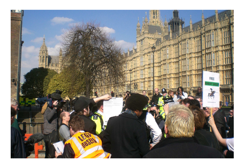
Figure 5: Police and activists outside Westminster