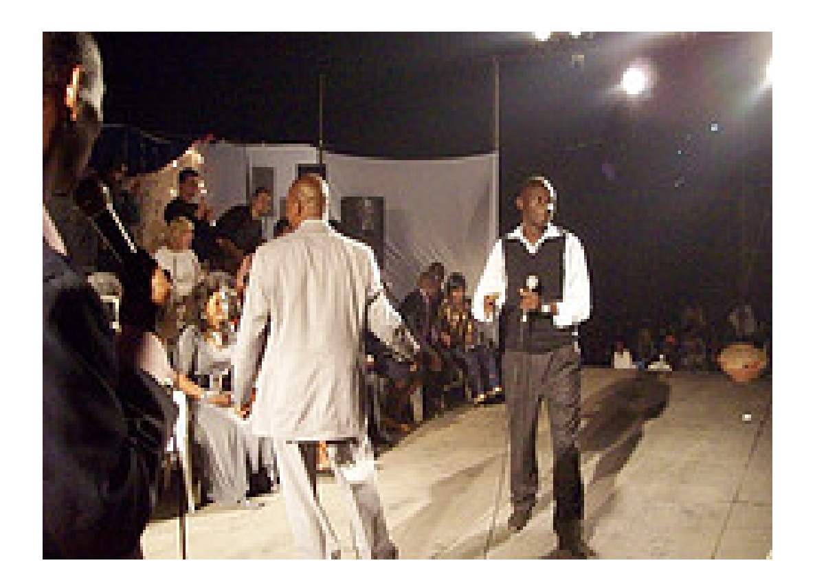
Figure 13 Bugembe Performing at During New Years Celebrations, at Kololo

Following the developments of the PAM Awards and VIGA, I have observed that these music awards have partly contributed to what Kalu has described as unstoppable creativity in Pentecostal music because of technology and continuous cultural interactions (2008: 122). These music awards have inspired individual Pentecostal music artists to divert from choral music which requires the participation of a group of people and instead work for personal recognition. It has also opened up the possibility for some Pentecostals (those who are not talented in musical performance), to cooperate with secular popular music artists especially in area of composing Christian music (Kayaga: Interview; 10.11.2009). It has also developed a spirit of competition amongst Pentecostals, in anticipation of winning awards thereby adopting new musical and dance choreographies. Further, it has attracted secular popular music artist to participate in such events, and to extend their popular artistic style to