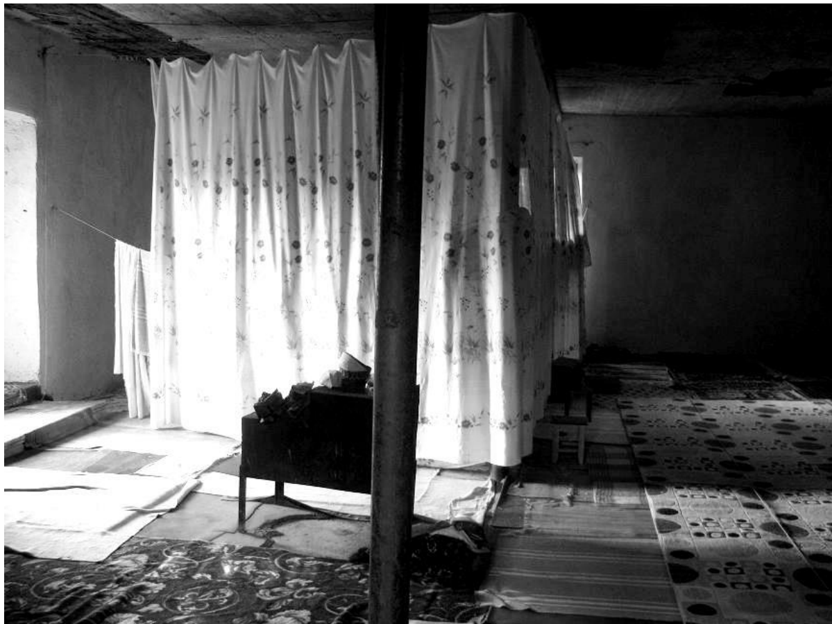
Mosque is divide two parties: part inside the curtain is for women and other part is for men