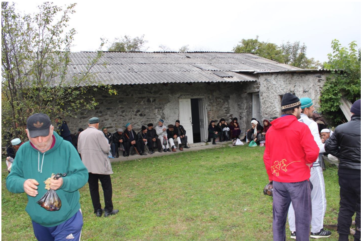
Kurban Bairam ceremony, people pray together and share sweets.