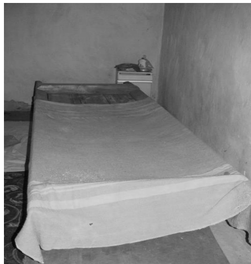
place of ritual washing of a