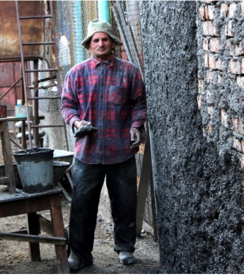
shaping wall in the village Tsodna