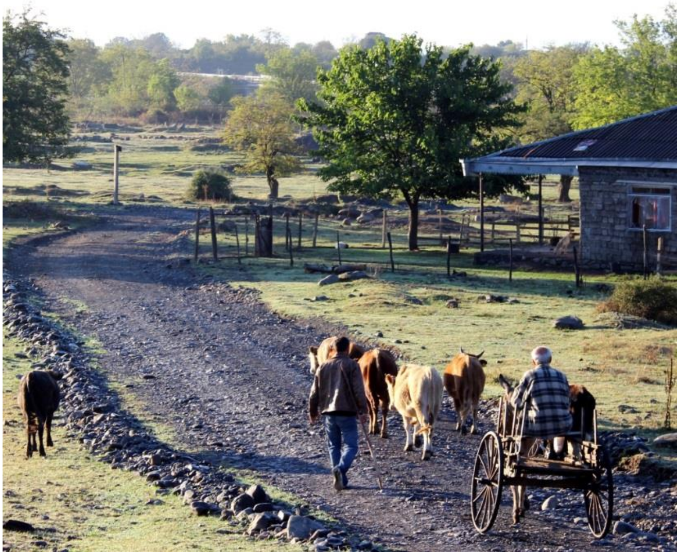
Going to bazaar for trade.