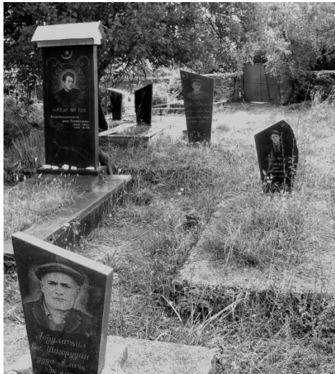
cemetery dead body