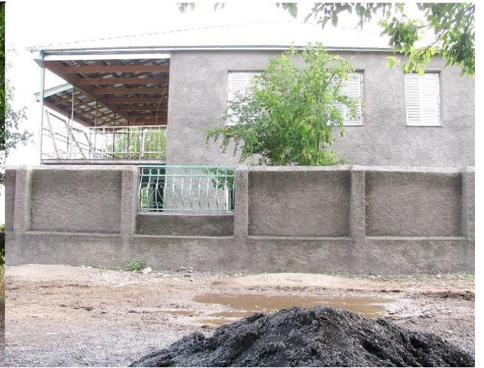
Same houses. 1 st picture I took when I was first time in the village Tsodna in 2009 and second in 2013.