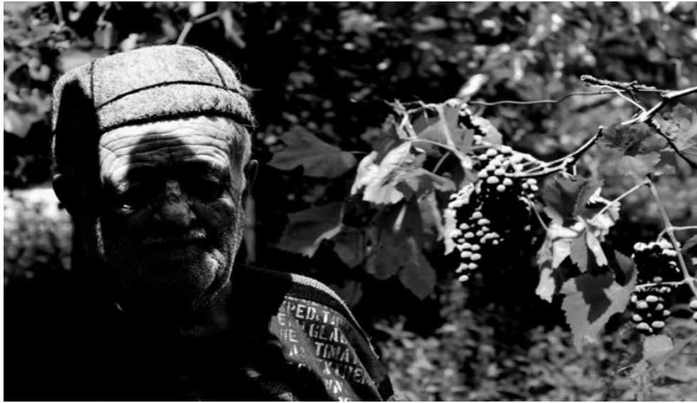
Old villager in his vineyard