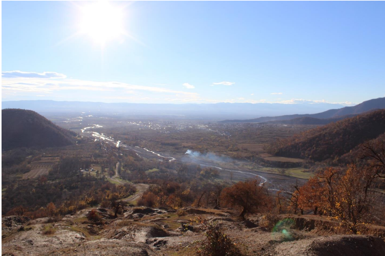
View from the hill.

Way from the base of Georgian military to the Adalai Mountain.