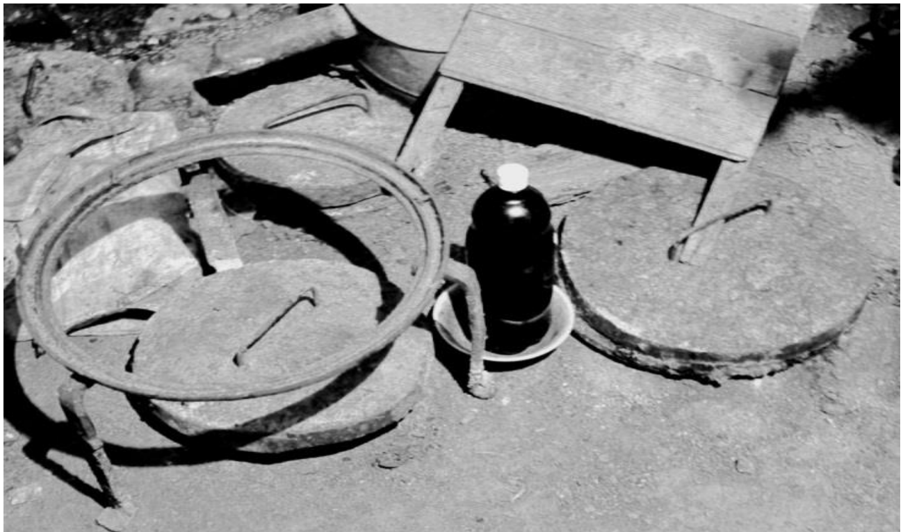
'Marani' _ Kvevri, bottle of wine and some tools for making wine and vodka