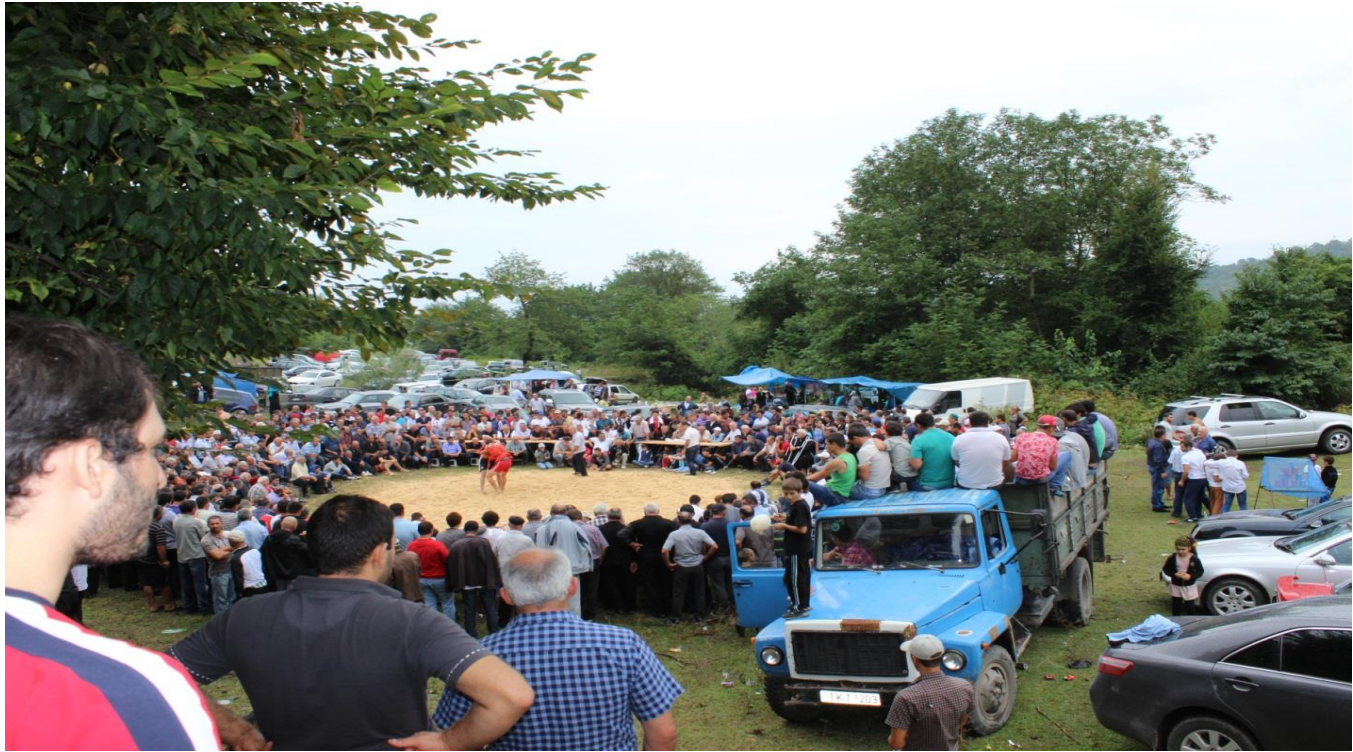
people are looking at wrestling