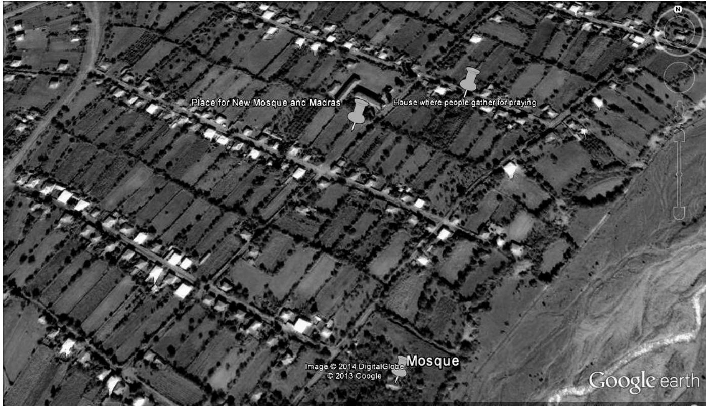
map of the village Tsodna