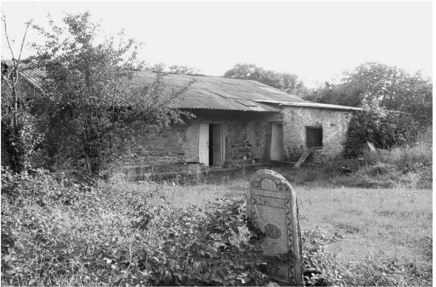
Mosque inside the cemetery