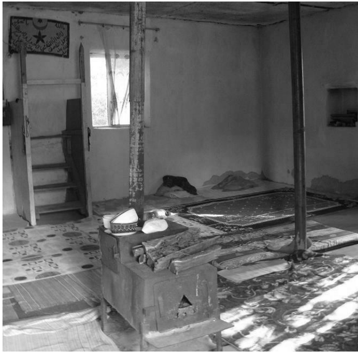
Handmade Minbar and 'Pechi' (Stove) inside the Mosque