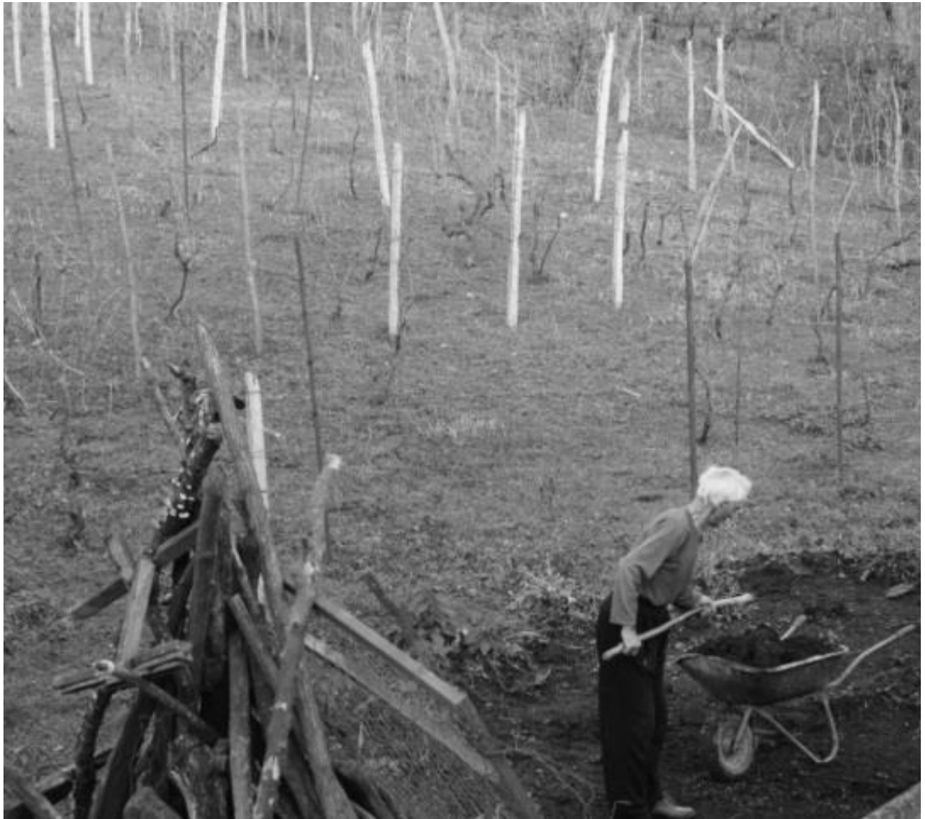
Worker in the vineyard from a neighboring village