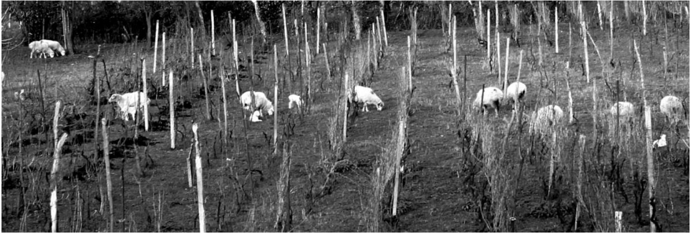
New perspective of vineyards: sheep in the vineyard