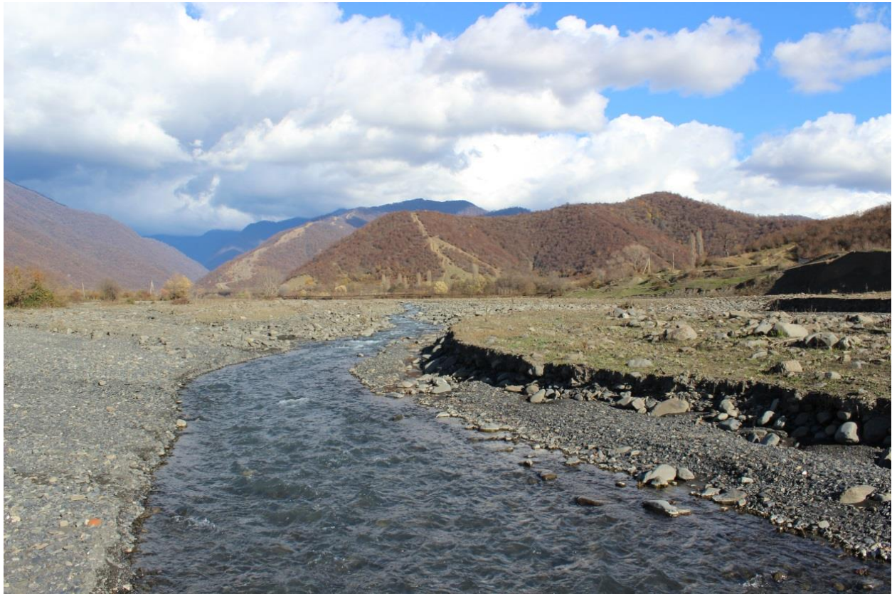
Way from the village Tsodna to the Adalai Mountain.