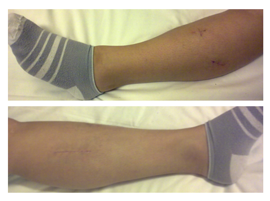
Figure 2. Photo of patient's legs. During surgery, symmetrical skin incisions were performed in the right and left legs. On the left leg, the three scars have been colored for better visualization. The fascias were split by distances of ~20 cm in the anterior, lateral and superficial posterior compartments, whereas the fascias of the deep posterior compartments were split by distances of ~10 cm.

Pain drawing has proven of value in discriminating a radicular pain caused by the L5-or S1-nerve roots from leg pain caused by CCS and possibly its referred pain to the trochanter and lumbar region, sometimes even up to the scapula. A closer look at this patient's pain drawing (Fig. 1) shows that its character is by far exceeding the radicular pattern usually seen in sciatica. Clinically, one needs to discriminate the pain in the anterior part of the leg caused by irritation of a L5-nerve root from the pain caused by an anterior CCS and correspondingly by the other compartments. Recently clinical examination proved more adequate