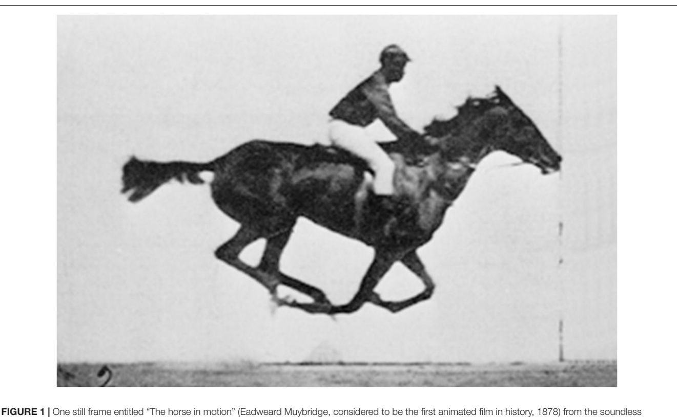
FIGURE 1 | One still frame entitled "The horse in motion" (Eadweard Muybridge, considered to be the first animated film in history, 1878) from the soundless animations used in the MRI experiment.

functional images were acquired with an EPI sequence, with the following parameter: 38 axial slices (128 × 128 matrix, 1.72 mm × 1.72 mm × 3.5 mm voxel size, field of view (FOV) 220 mm, echo time (TE) 30 ms, repetition time (TR) 3,000 ms, flip angle 90°). For the paradigm with the moving objects, 190 volumes were acquired, for the paradigm with the moving animals, 130 volumes were acquired, and the optic-flow paradigm consisted of 114 volumes.