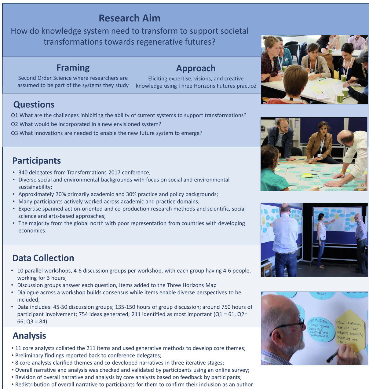
Box 1. The research methodology.

Multiple checks and balances were used throughout the process to ensure the results and narrative reflected the views and perspectives of researcher-participants and reduce biases created by interactions of research-participants acting in different roles, such as facilitators, analyst and participants in accordance with suggestions for enhancing rigor [36]. This included: (1) Sharing and deliberation of ideas in the parallel workshops at the conference; (2) careful coding and preliminary analysis using multiple analysts who had been present in different workshops; (3) feeding back preliminary analysis to participants during the conference; (4) multiple iterations of cross-checking by multiple analysts post conference; (5) working with comments from the researcher-participants about the overall narrative; and (6) final approval of the narrative through participants by agreeing to be a co-author before the paper was submitted. In this last stage, only one person declined to be an author, while four newly joined after email communication errors had been clarified. Combined with the facilitators and analysts, this led to the total of 183 authors on the paper. In conclusion, while a different group of participants may have led to