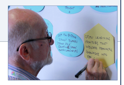
Box 1. The research methodology.

Multiple checks and balances were used throughout the process to ensure the results and narrative reflected the views and perspectives of researcher-participants and reduce biases created by interactions of research-participants acting in different roles, such as facilitators, analyst and participants in accordance with suggestions for enhancing rigor [36]. This included: (1) Sharing and deliberation of ideas in the parallel workshops at the conference; (2) careful coding and preliminary analysis using multiple analysts who had been present in different workshops; (3) feeding back preliminary analysis to participants during the conference; (4) multiple iterations of cross-checking by multiple analysts post conference; (5) working with comments from the researcher-participants about the overall narrative; and (6) final approval of the narrative through participants by agreeing to be a coauthor before the paper was submitted. In this last stage, only one person declined to be an author, while four newly joined after email communication errors had been clarified. Combined with the facilitators and analysts, this led to the total of 183 authors on the paper. In conclusion, while a different group of participants may have led to