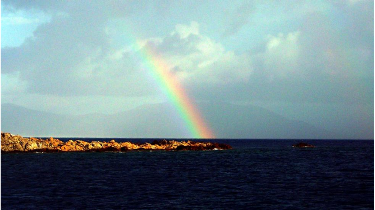
Fig. 13 Rainbow over Mykonos, late morning October 2010.

of a color was developed partially based on what language was available. 47 But terms for the blue to violet range do of course exist in both Greek and Latin ( kyanos , halourgos , porphyreos , caeruleus , purpureus , etc.). Thus linguistic limitations should not have prevented artists from drawing bands of blue and violet. 48