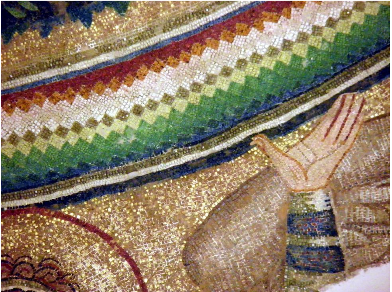
Fig. 7 Rotunda, Thessaloniki. Detail of rainbow border.

no-longer-extant Christ-Helios in the centre of the large medallion (see fig. 14). The silver stars suggest the light of the night, while the rainbow represents daylight. 25 Light symbolism is further indicated by the light-emanating Phoenix and by rays of light that emanate from a (no-longer-extant) cross.