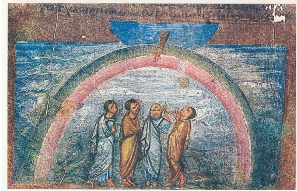
Fig. 4 Vienna Genesis . God's Covenant with Noah. Vienna. Österr. Nationalbibliothek. Photograph: © Wikimedia Commons.

personified rainbow Iris flows through the air dressed in green, yellow and red (fol. 74v). The rainbow arching above her head like a billowing veil is depicted in the same colour scheme as in the Council of the Gods. Virgil refers to Iris 'dragging a thousand colours through the air' (Aen. 4. 700-702). 17 By contrast, one might claim that the restricted colour gamut of the represented bow contradicts the poet's description of the 'mille colores'. At least, there is no direct correspondence between the visual and the verbal perceptions.