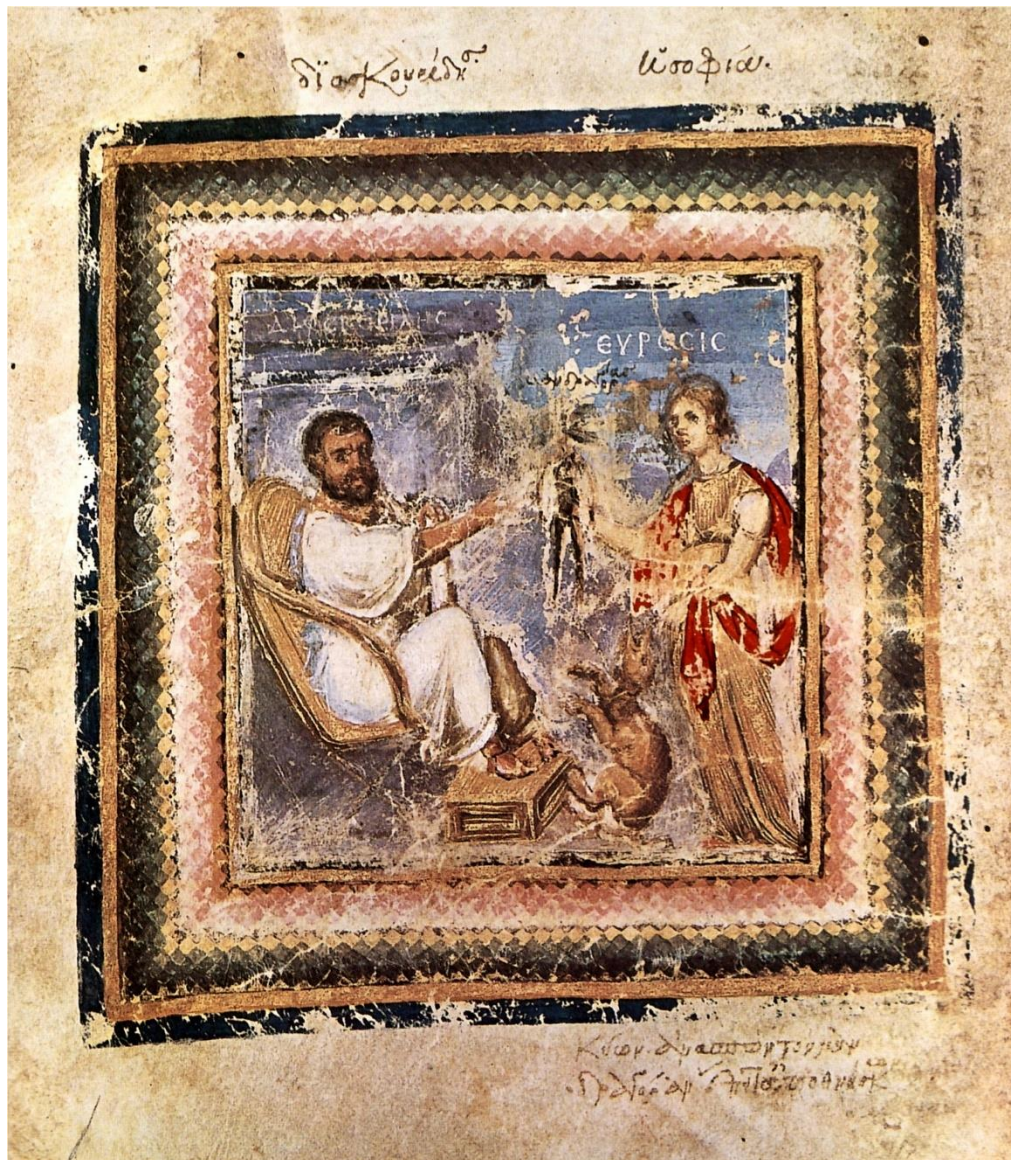
Fig. 5 Vienna Dioskurides . Rainbow border. Vienna. Österr. Nationalbibliothek.