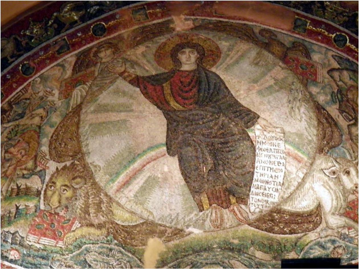
Fig. 8 Hosios David, Thessaloniki. Christ enthroned on rainbow border.

be explained by the image being conceived from within, so that red is actually the top colour.