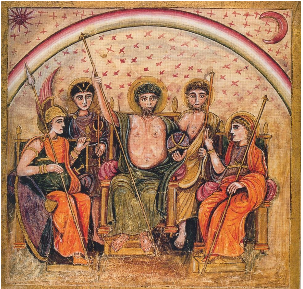
Fig. 3 Vergilius Romanus . Council of the Gods. Bibliotheca Vaticana.