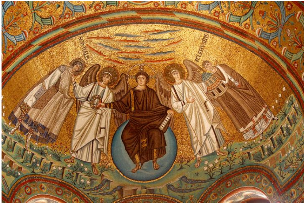
Fig. 10 San Vitale, Ravenna. Segmented rainbow.

mosaic displays a sophisticated range of optical phenomena that probably are to be understood in connection with the complex overall message of the mosaic, which so far has not been fully revealed (Figs. 8-9). 31