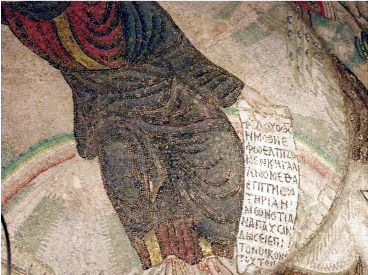
Fig. 9 Hosios David, Thessaloniki. Detail of rainbow throne.