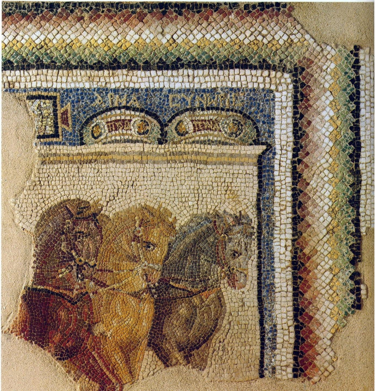
Fig. 1 Chariot race floor with rainbow border. Thessaloniki, Archaeological Museum.

rows of differently coloured tesserae: from the horizontal upper edge the colours are red, orange-red, pale pink, white, yellow, light green, dark green. On the right it continues vertically in the reversed sequence. The rainbow design is edged on both sides by black triangles. Since blue tesserae have been employed as a background to the crowns and the inscription, the absence of blue in the rainbow is not due to restrictions of the medium.