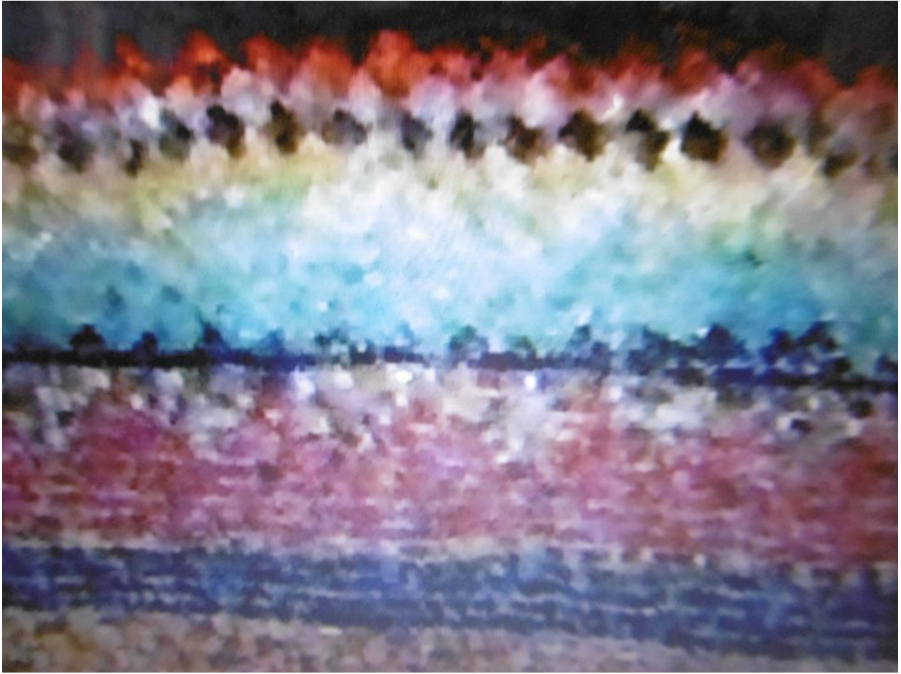
Fig. 12 San Vitale, Ravenna. Digital zoom (b.) of rainbow colours.