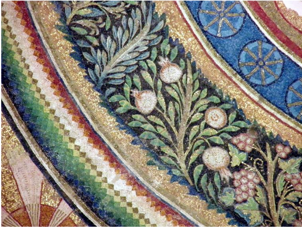
Fig. 6 Rotunda, Thessaloniki. Stars, floral wreath and rainbow border.

the innermost band this rainbow border shows: dark purplish, three greens, yellow, white, pale pink in two tones and red. 23 (Fig. 5) With regard to the natural bow, the order is reversed. The reversal, seen also in other images, can be understood as the bow being conceived from the viewpoint of the persons depicted within the frame: if so, red actually becomes the topmost hue. The manner of painting with the colours arranged in indented diamond shapes reveals that the design imitates a floor- or wall mosaic, the border being very close to the one preserved in the Chariot race floor from Thessaloniki. The significant difference between the two is that another hue has been added to the rainbow: a dark colour, verging on violet (the precise colour is hard to define due to degrading of the pigments over the years).