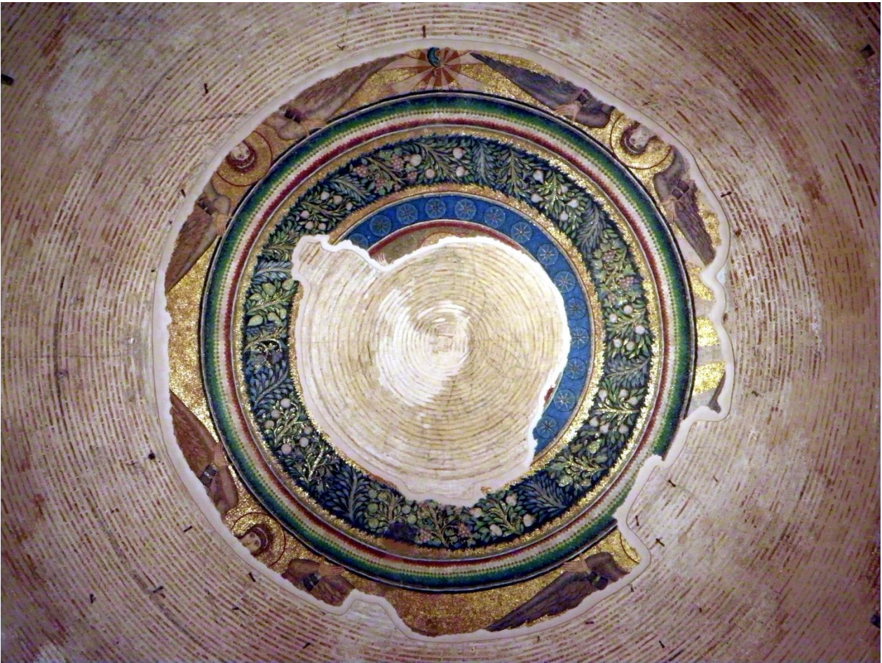
Fig. 14 Rotunda, Thessaloniki. Cupola medallion with full rainbow circle.

In contrast to the red-green dominance of the arcs in the illuminated manuscripts and the floor mosaic, the most complex chromatic range is encountered in the wall-mosaics of the Rotunda and San Vitale. It is reasonable to assume that the monumentality of the churches led to a more elaborate rendering of rainbows than the one encountered in pavements. Since the seasonal wreath in the Rotunda contains plants, flowers and fruit of all the seasons – a comprehensive expression of eternity – the rainbow may be said to contain elements of all rainbow manifestations including the spectral hues, the red sunrise and the white lunar rainbow. The Rotunda iris – like the smaller equivalents in San Vitale – is designed as a circular frame and actually displays an entire rainbow circle, as if seen from a very high point such as the top of a mountain ( Fig. 14 ). The rainbow is ‘an image of the sun, albeit a wildly