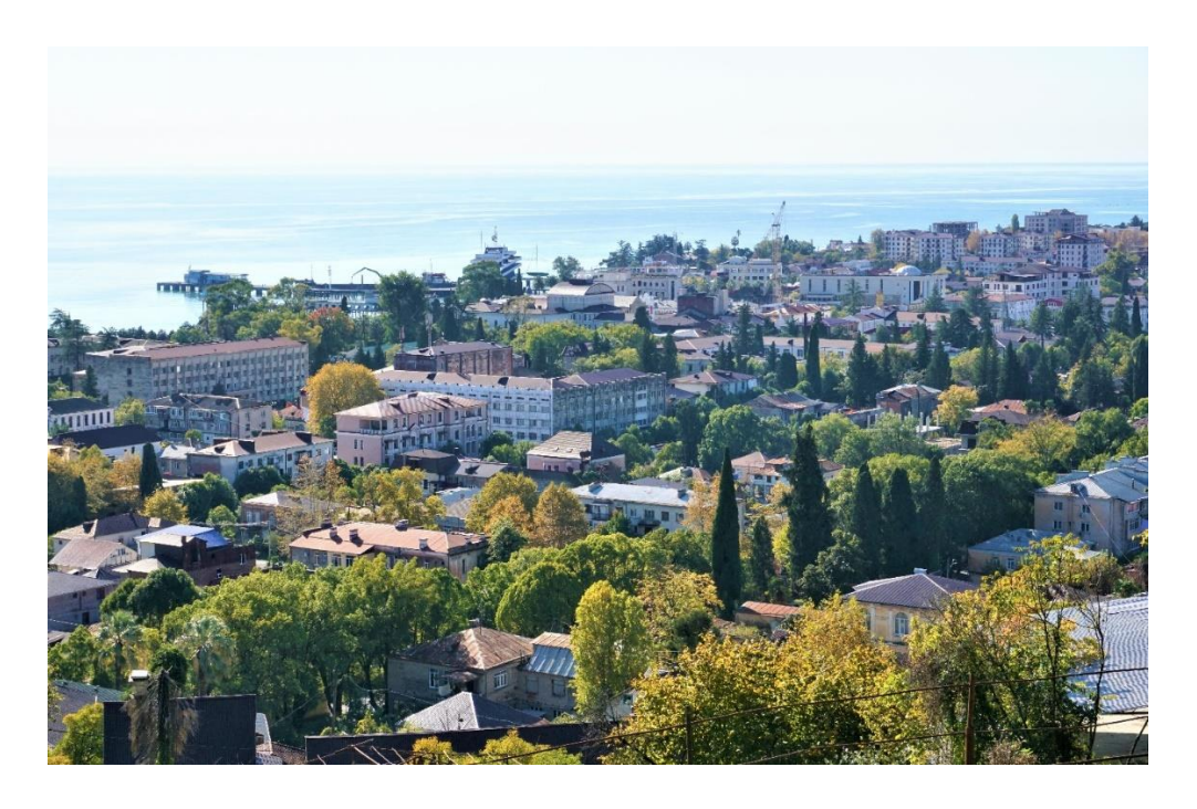
Picture 2: Parts of the city center of Sukhum seen from a viewpoint at Sukhumskaya gora (Sukhum mountain).

as the rest of the region, the demographics of Sukhum has changed dramatically over the past decades. The majority of the inhabitants, close to 70%, are Abkhaz, whereas Russians make up almost 15%, Armenians 10% and the rest consists of a mix of the earlier mentioned groups of people (Bærug 2021). During the Soviet era, Sukhum was a favoured place for travel among the elite of the Soviet Union. The city was badly damaged during the war, and material evidence of this is visible all over the city; from memorial monuments to destroyed buildings filled with bullet holes. There are two sports stadiums in the city, a large open-air market, a former research facility<sup>3</sup>, many cafés and restaurants, parks and green areas, beaches and a pedestrian embankment that stretches three kilometres along the coast of the city. The parliament and government buildings are also located in Sukhum.