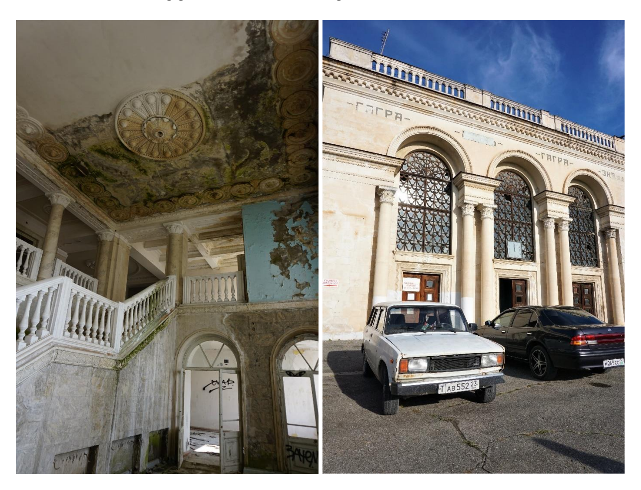
Picture 3: inside the abandoned Sanatorium Gruziya in Gagra. Picture 4: Georgian writing is covered at the train station in Gagra – a common sight at other train stations as well.

particular from Chechnya and other North-Caucasian states that sympathized with Abkhazia's fight for independence. The war ravaged the country for more than a year, until the Abkhaz forces managed to recapture Sukhum on the 27 September in 1993. The war resulted in thousands of deaths on both sides, massive material damage and more than 200,000 Georgians and Mingrelians who were forcefully<sup>8</sup> displaced from the region (O'Loughlin, Kolossov, and Gerardtoal 2011: 7). The Georgian forces had to withdraw and although Abkhazia won the war militarily, it was left in ruins, still without having gained international recognition.