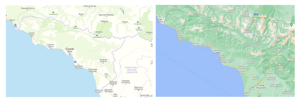
The line is differently presented in both screenshots, as are the languages used for place names. Illustration 1: screenshot from Yandex.Maps<sup>15</sup>. Illustration 2: screenshot from Google Maps<sup>16</sup>.

In both Abkhazia and Georgia, maps are used actively to claim territory that they each believe they hold the rights to. Throughout the time I spent in Georgia, maps were frequently used to underline the shape of Georgia. Often both Abkhazia and South Ossetia were shaded in a different colour, indicating these regions' altered status as "occupied". I noticed maps like these on poster, flyers, painted on walls, and a girl I met in Tbilisi even said she had seen a man having a tattoo of it on his arm. A more recent example of how the flag can be used politically was during the final of the Eurovision Song Contest (ESC) in May 2021. During the distribution of the jury votes, the Georgian representative wore a white t-shirt with a large, green print of the shape of Georgia which, of course, included both Abkhazia and South-Ossetia. As ESC is viewed by more than 200 million people around the world, this was doubtfully an unconscious choice. When I arrived in Abkhazia, the map of Abkhazia was just as frequently used to legitimize and promote national identity. I found maps outlining the shape of Abkhazia on anything from souvenirs, stamps (despite not having a functioning postal system), t-shirts, billboards, and books to name a few. Maps of Abkhazia were also frequently used on memorial posters of the war or for the fallen soldiers and heroes<sup>14</sup>.