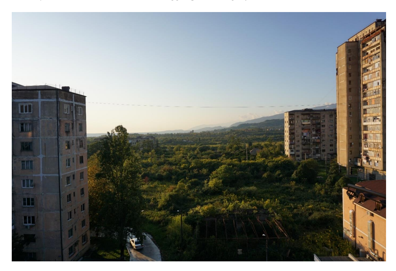
Picture 8: the view from the balcony, taken in the middle of October 2019.

undisturbed horizon, reminding the viewer of what had been before. Ruins of villages and houses were hidden under the lush natural surroundings, soon only visible to those who knew where to look. Burnt out and bombed houses, schools and buildings peppered the landscape, connecting the past to the present and the future. What at first had seemed like a calm and peaceful view revealed a history that also included violence, struggle, pain, and grief.