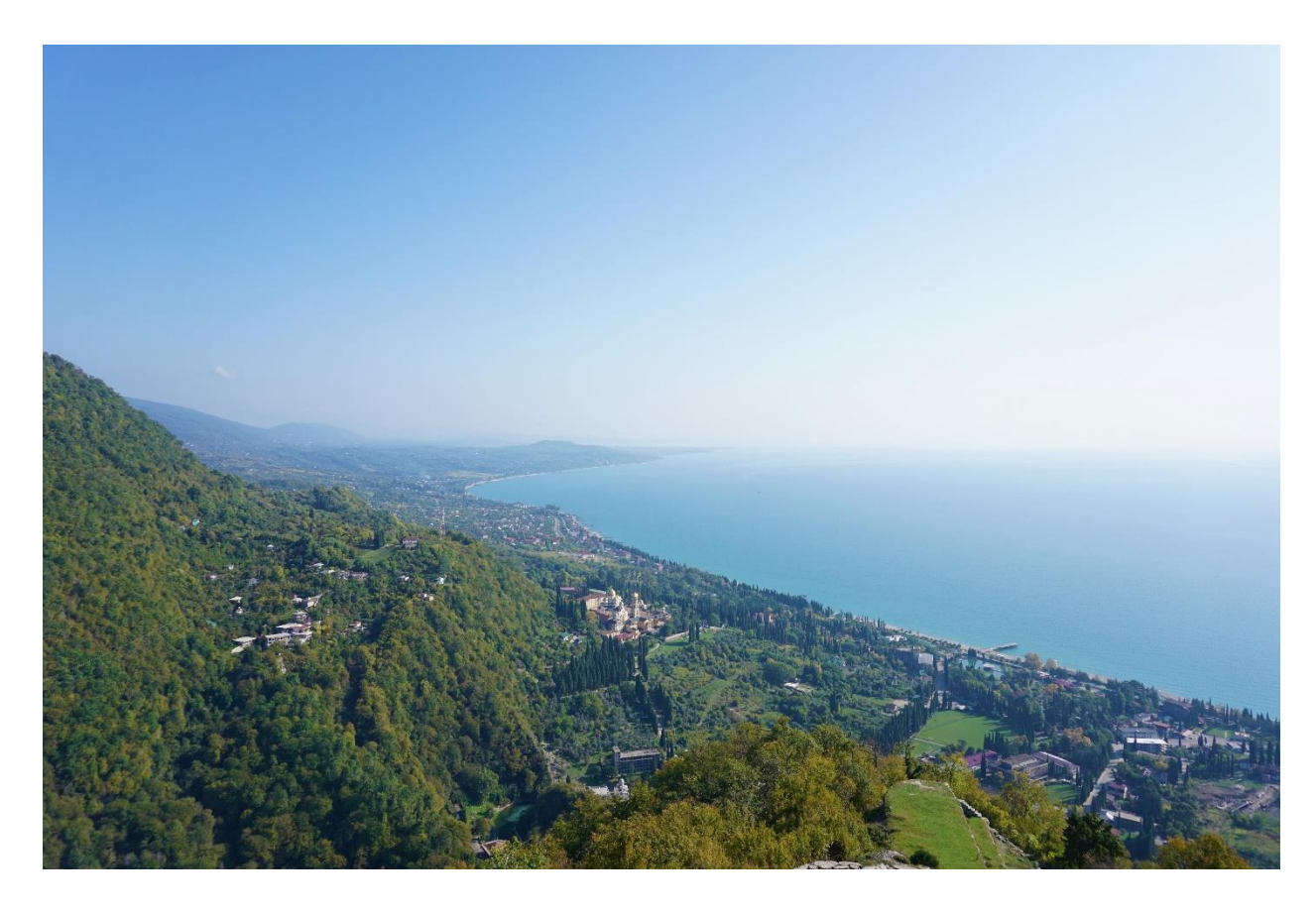
Picture 1: the lush foothills meet the Black Sea in the view from Anacopia fortress. The Noviy Afon Monastery is seen in the middle of the picture, and Sukhum is located far away in the very back.

The demographic composition of Abkhazia has been reshaped by the violent turmoil that large parts of the Caucasus experienced over the past 30 years and is largely why the political conflict between Abkhazia and Georgia remains unsolved. Below, I present some numbers and statistics to show how the ethnic composition of Abkhazia changed as a result of the 1992-93 war. Before using such numbers, one should be aware that figures like these often are used in separate ways by both the Georgian government and Abkhazian side to advocate their perspectives. In Georgia, demographic statistics are often used to illustrate the clear majority of Georgians in Abkhazia before the war, whereas in Abkhazia, such statistics are used to "show how Soviet policies brought in Georgian migrants that significantly tipped the demographic balance and rendered Abkhazians a minority in their own territory" (Kabachnik 2012: 401). Irrespective of their political use, they illustrate the drastic changes in the ethnic compositions of the demography of Abkhazia over the past three decades, and thus also indicate key issues of contention in the ongoing conflict.