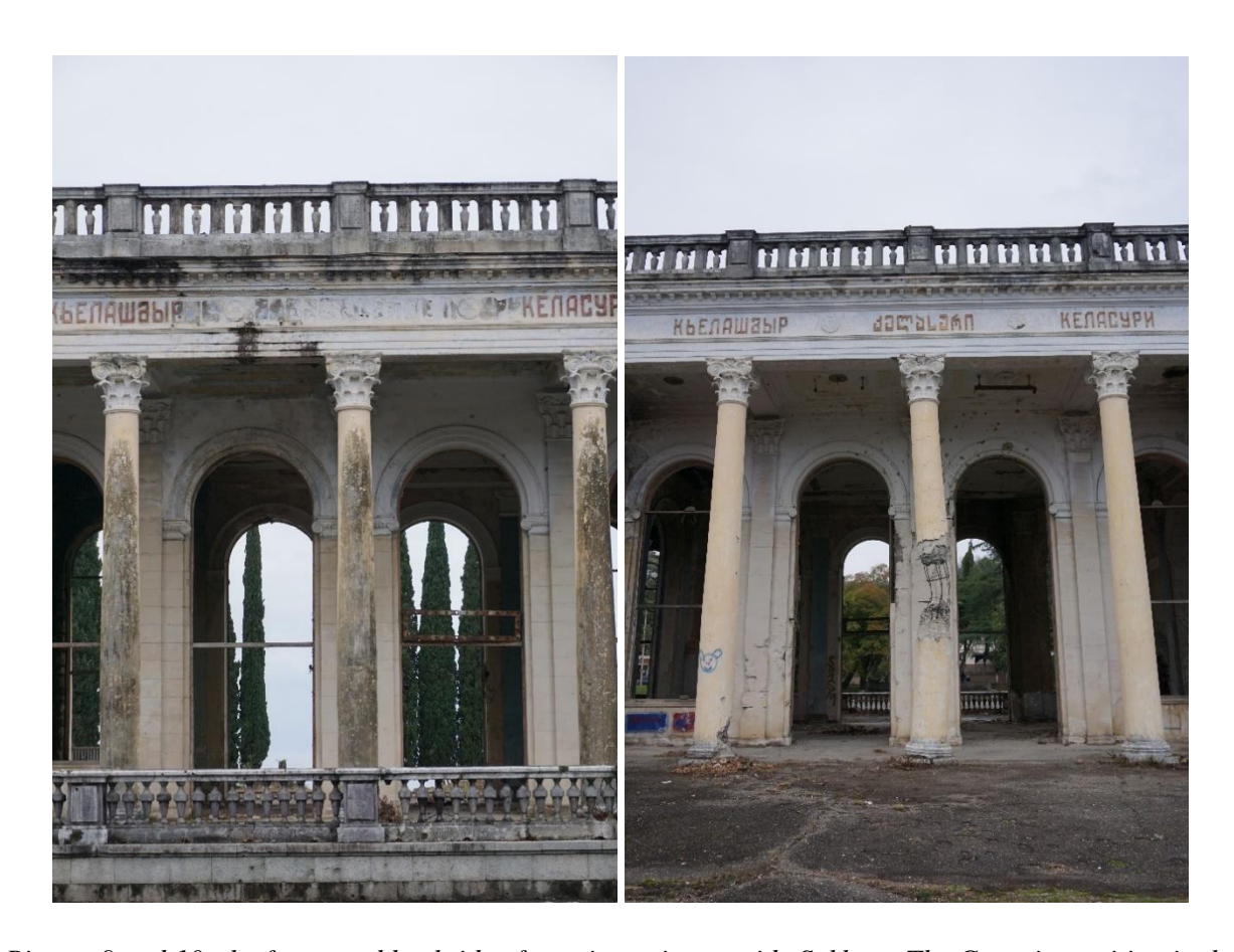
Picture 9 and 10: the front- and backside of a train station outside Sukhum. The Georgian writing in the middle has been chiselled away in the front but kept on the backside of the building.