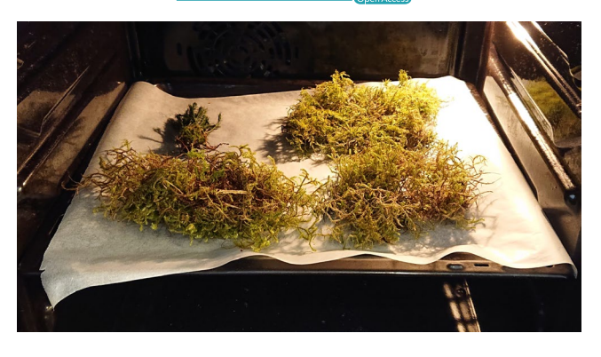
FIGURE 1 Drying four different species of bryophytes in a regular oven at 40°C for a couple of hours to obtain dry weight. This is step one in a DIY at-home experiment to find the water holding capacity of different kinds of bryophytes.

germination trial. By sharing these at-home DIY experiments we increase the number of described experiments of this kind in the STEM disciplines, for people to use, or draw inspiration from.