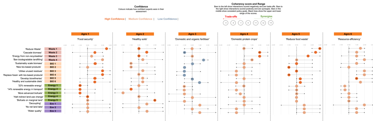
Fig. 3. Interactions between bioeconomy and agro-food policy domains. Interactions are shown per each pair of goals. Position of circle indicates coherence score. Colour of circle indicates expert confidence (low, medium, high). Black lines indicate upper and lower ends of the coherence scores given by experts.

In this case, results indicate that bioeconomy policy goals are perceived to be largely consistent (meaning two goals do not interact) or synergistic (meaning two goals interact positively) with agro-food policy goals. While all four policy domains register synergies across all three possible synergistic scores (enabling +1, reinforcing +2, indivisible +3), trade-offs are weaker in strength. All policy domains have some trade-