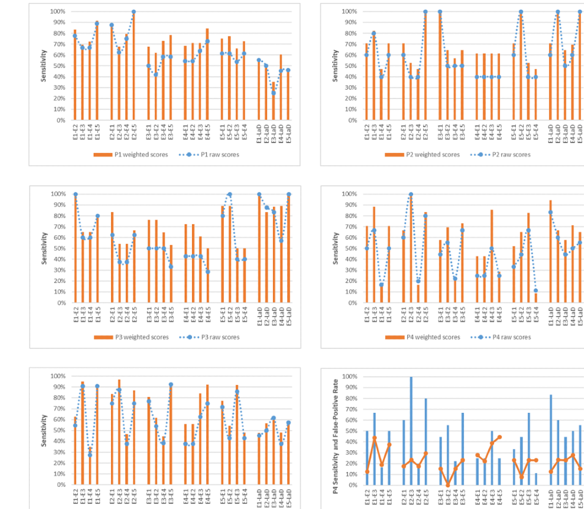
Figure 2. The interrater pairwise sensitivity scores for the five cases.