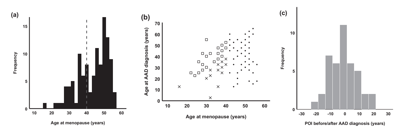
Figure 2. Age at menopause. (A) Age at menopause in women with AAD. (B) Age at menopause compared to age at AAD diagnosis. (X) POI after/same time as AAD, ( \Box ) POI before AAD, ( \cdot ) menopause after 40 years. (C) Timing of POI diagnosis in relation to AAD diagnosis. POI, primary ovarian insufficiency; AAD, Addison's disease.

We tested associations to 104 POI- or AAD-associated genes. When applying the Bonferroni-adjusted significance level of 0.00048, no between-group differences were detected for any of the 104 genes tested for. Eight of the 104 loci reached nominal significance, including 3 (FOXL2, PNO1, and DDX4) with a minor allele frequency >5% (Table 3 and (22)). Since genotyping and imputation of rare alleles (defined as <5%) are prone to inaccuracy for technical reasons, the genotypes reported for the remaining