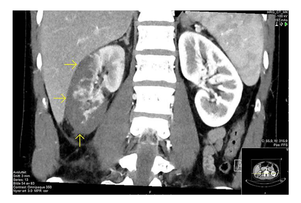
Fig. 1. Lack of contrast enhancement in the peripheral parts of the right kidney and fat stranding in the surrounding tissue could be consistent with severe pyelonephritis or renal infarction.

Haaskjold et al.: A Rare Case of Unilateral Renal Cortical Necrosis