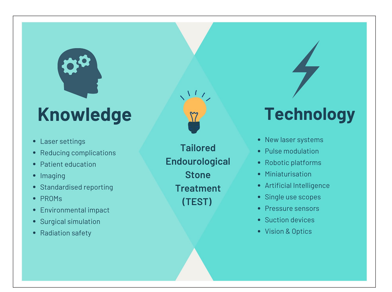
Figure 3. Tailored endourological stone treatment.