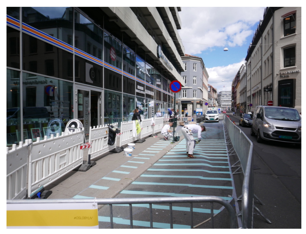
Figure 6: Implementation of temporary measures and use of street furniture to create a car free city centre through the "Bilfritt byliv" project (photograph by the author).

course but also business associations and youth groups. As for Addis Ababa, informants were interviewed in their official capacity, predominantly in their offices.