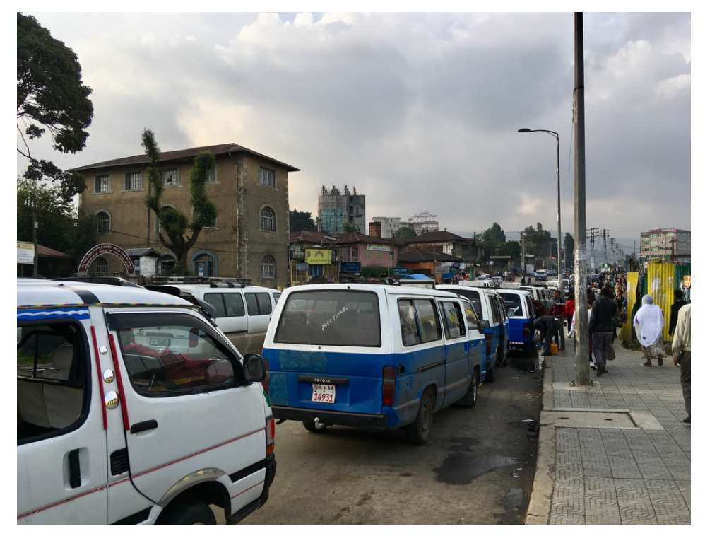
Figure 3: Low public transport capacity has led to long waiting times; the majority of total passenger trips are covered by a privately operated network of 12-seater minibuses.

Currently, the development in Addis Ababa is integral to the high-modern visions of Ethiopia's developmental state to become a middle-middle income, climate neutral, and resilient economy by 2025. Therefore, Addis Ababa's urban development is also shaped by its role as a key arena in which the aspirations of modern Ethiopia are showcased and materialised (Weldeghebrael, 2020). This has resulted in inner-city redevelopment projects such as slum clearance and high-rise buildings, ambitious public housing projects, and high-profile public transport projects, often framed as symbols of modernity. This has led to a critique of 'dubaification' (Angelil and Hebel, 2016) of the city, where hallmark office and residential buildings are replacing the low-rise buildings in the city centre. Much of the population growth is planned to be channelled to new large-scale prefab condominium housing developments at the fringes of the city, which are also meant to alleviate the shortage of affordable housing.