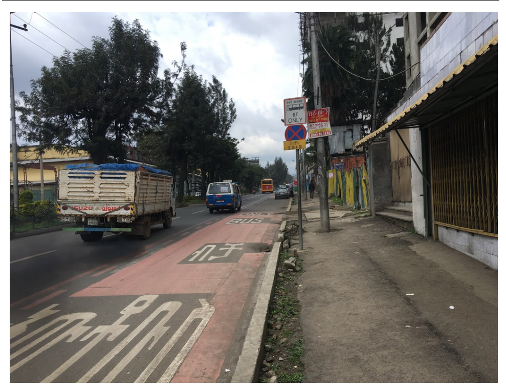
Figure 5: Informal street parking at dedicated bus lanes was regarded to constrain the efficient flow of traffic (photograph by the author).

In Addis Ababa, a total of 27 interviews were conducted with 21 informants, at a venue chosen by the informants. Evidence from these interviews were primarily used in Papers 2 and 3. The interviews were predominantly conducted in the offices of the informants, although some interviews were made at cafés or hotel lobbies. Interviews were scheduled through email or telephone, and consent was obtained orally prior to each interview. Informants were interviewed in their official capacity as public servants at municipal authorities, development agencies, and NGOs. While they primarily represented their respective authorities and organisations, they were generally open to reflect also on challenges in their projects. The interviews were conducted in English on the informants' request, and no interpreter was needed. Initially, I strived to record the interviews and transcribe them verbatim. However, I soon found it more conductive to abstain from recording the interview and take notes instead – partly due to the advice from my informants who noted that they were able to speak more freely when they were not recorded. In those cases, the notes were finalised each evening after the