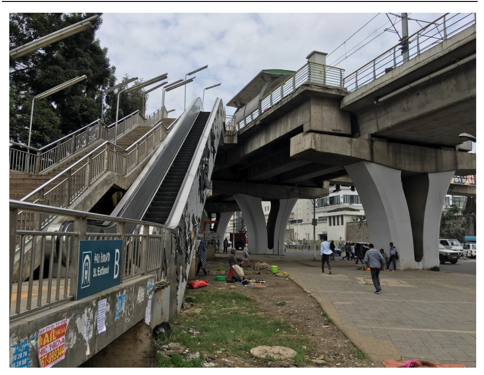
Figure 4: The light-rail transit was widely considered to be poorly integrated in the city.

I arrived in Addis Ababa for the first time in July-August 2018. This was right after prime minister Abiy Ahmad had been elected to office; there was a general atmosphere of hope and optimism in the city. Subsequent research visits to Addis Ababa were conducted in November-December 2018 and in September 2019. As part of my research, I became an affiliated researcher at the Department of Geography and Environmental Studies at Addis Ababa University's lush Sidist Kilo campus. A final research visit, meant to coincide with a stay as guest researcher at Addis Ababa University, was scheduled for April-June 2020, but had to be cancelled due to the COVID-19 pandemic. At about the same time, the political climate in Ethiopia rapidly changed due to the conflict in the Tigray region.