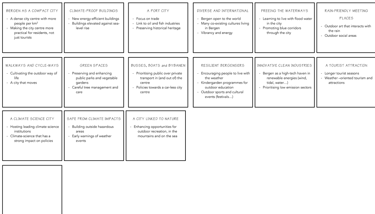
Fig. 2. The 16 pre-written 'dimension cards', to flesh out the scenarios.

the dimensions of Bergens past and present that are considered important for its future (for instance the card 'Bergen as a climate science city' was chosen by all groups).