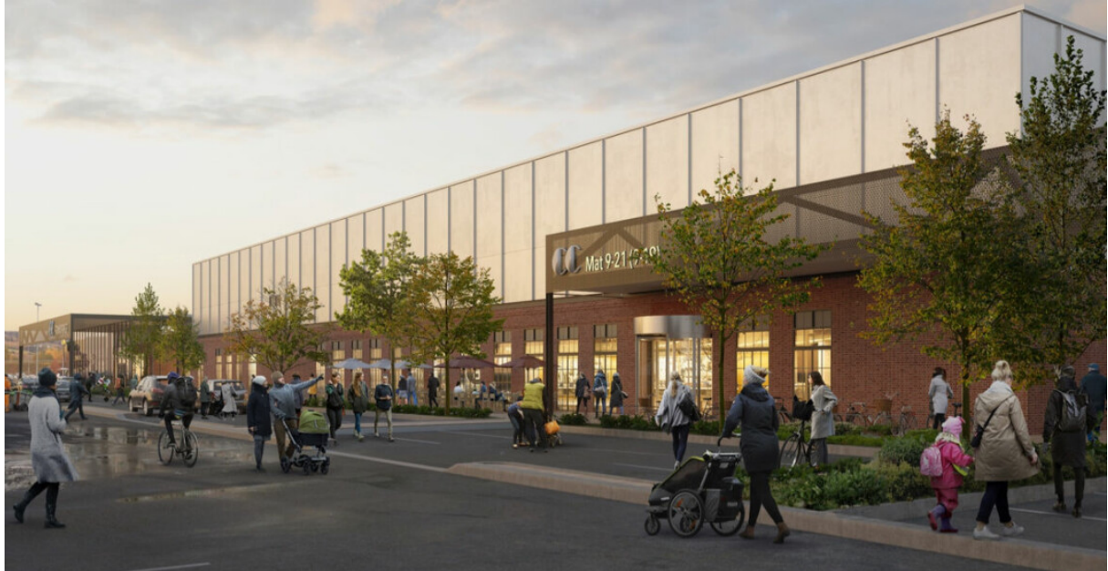
Bilde 5 - Kiwi Damsgårdssundet, Bergen, fra Kiwi sin Facebook side 28. februar 2019 https://www.facebook.com/kiwiminipris/photos/pcb.2350086821682234/2350086708348912 (hentet 3.11.2022)