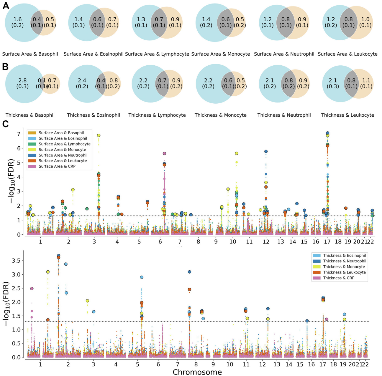
Figure 2. Bivariate MiXeR and conjunctive FDR results. (A) Venn diagrams representing the genetic overlap (gray) between surface area (blue) and the white blood cell counts (orange). (B) Venn diagrams representing the genetic overlap (gray) between thickness (blue) and the white blood cell counts (orange). For plots A and B, the size of the circle depicts the polygenicity of the phenotype. Numeric values represent the estimated number of trait-influencing variants, with the standard deviations of estimates in brackets. These values are in thousands rounded to the nearest 10th (e.g., 1.5 = 1500 variants). (C) Manhattan plot displaying conjunctive loci associated with immune markers and surface area (top) as well as thickness (bottom). Larger circles outlined in black represent lead variants. CRP, C-reactive protein; FDR, false discovery rate.

Supplement 1). Genetic variants jointly associated with surface area and immune markers were distributed across the genome (Figure 2C; Table S5 in Supplement 2), with 55 unique loci identified (Table S6 in Supplement 2), and monocyte count had the greatest quantity of shared loci ( n = 34 ). Shared loci with surface area overlapped across the 7 blood immune markers (Figure S6 in Supplement 1). In