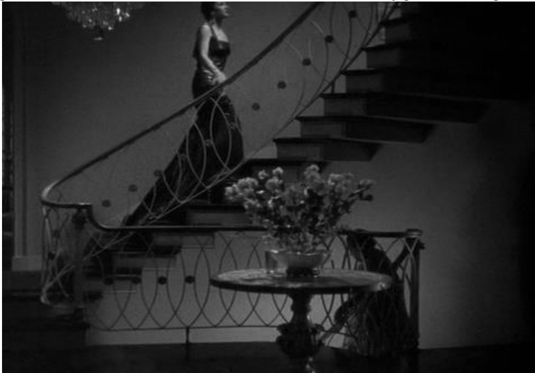
Fig. 6: Image from Stahl's 1934 film adaptation of Imitation of Life .

Where the novel hints at racial inequality, John M. Stahl, in his 1934 movie adaptation, visualizes these inequalities by use of strong, symbolic imagery. Historian Donald Bogle comments that the movie adaptation was "the one Hollywood film of the Depression Era that suggested there was such a thing as a contemporary race problem in America" (Turner Classic Movies). This is especially clear in one scene in particular. Stahl uses the previously discussed passage where Delilah rubs Bea's feet as an introduction to a very powerful image. After the