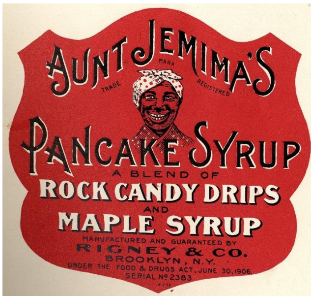
Fig. 2. Rigney and Company's "Aunt Jemima's Pancake Syrup," evidence from the court case in 1915.