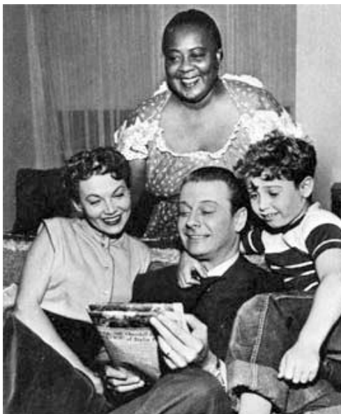
Fig. 7: Louise Beavers as Beulah in one of the show’s episodes.

Before exploring the so far most recent layer in the “mammy palimpsest,” namely the stereotyped Latina nanny, a short outline of other mammy portrayals of the twentieth century is necessary. Not much has changed after Hurst’s and other representations in literature and popular culture, for several of these mammy figures display very stereotypical traits. Perhaps most striking is the character of “Beulah” in the TV-series with the same name. The series ran from 1950-53, and revolves around the Henderson family and their housekeeper,