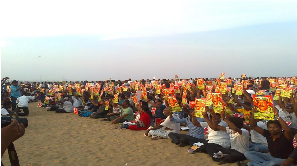
The crowd holding portraits of the LTTE leader

sources for activists and the solidary public, in informing political engagement and social actions and articulating Tamil identity.