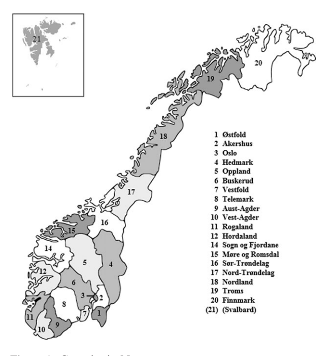
Figure 1. Counties in Norway.

1961–1991 – Fig. 2A,B illustrates the time trends in the prevalence and incidence of MS in Norway