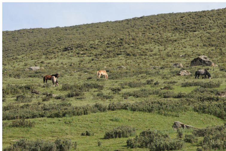
Figure 1 Breeding habitat of the Tibetan Partridge. A part of the north-facing slope where nests were found in Gyama valley near Lhasa, Tibet.

In June 2005, before most nests were found, we carried out a basic vegetation survey in the study area in an attempt to get a general overview of the plant species that