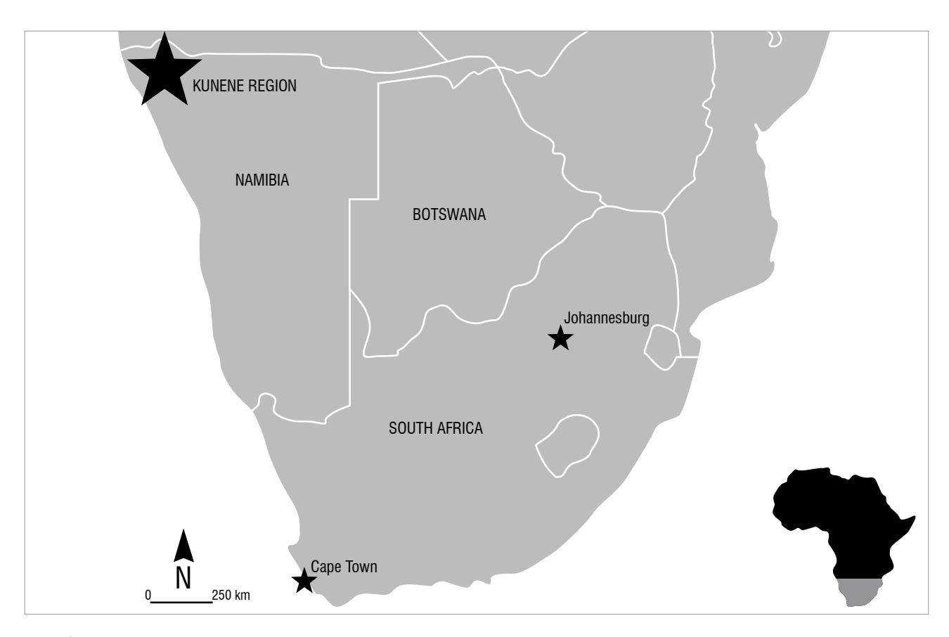
Figure 1: The location of the Kunene Region of northern Namibia within southern Africa.

We used 24 ochre samples derived from ethnographic and nonarchaeological geological sources likely to have been exploited during the MSA. Of these samples, 12 were collected from the Okamanga,