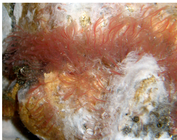
Figure 2. Dense growth of Osedax mucofloris on a bovine bone in a laboratory aquarium. White growth is Beggiatoa -like bacteria.