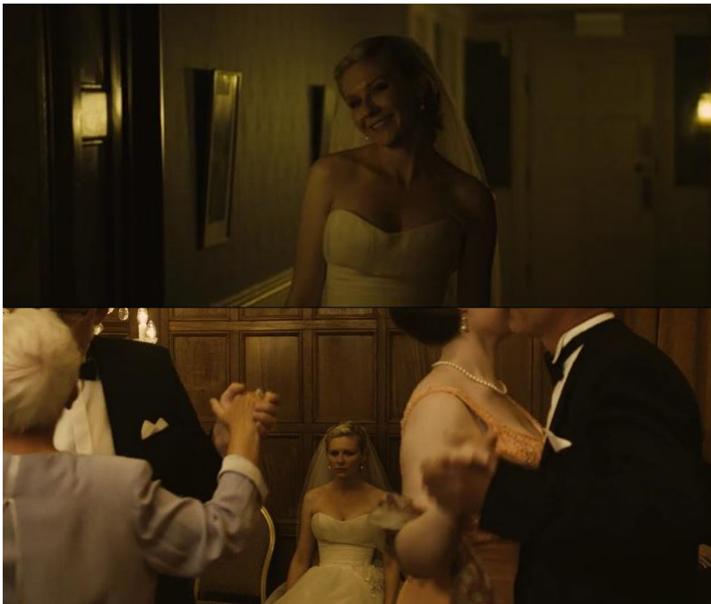
Fig 29 79

The sisters' close relationship allows them to tell each other uncomfortable truths. Justine knows that Claire doesn't like to hear her complain, and in return, the latter reproaches the bride for her fake smile and her marital neglect.