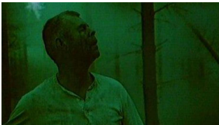
Fig.7, Befrielsesbilleder . Den Danske Filmskole, DR, 1982. Dir. Lars von Trier

nestling on top of a pine tree with images of defeated soldiers. It can be interpreted as a play on exterior calm versus internal tumult – the contrast the action rests upon. In the forest scenes, the greenish hues of the morning and the bright pale light create a sort of convalescent atmosphere. After the punishment, they give way to mist and brightness. The camera focuses on a middle shot of the blind officer looking upwards, while a background screen plays an ascending pedestal shot of the forest. This gives the illusion of the character’s ascension to the sky. Sufferance transfigures Leo and so the Nazi becomes the martyr.