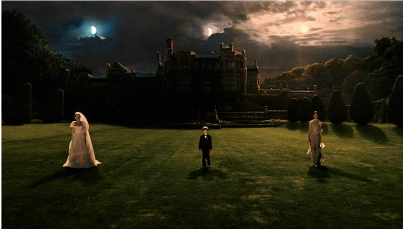
Fig. 27 75

Towards the end, it is the women's shared love for the child that makes them forget their differences and embrace destruction together.