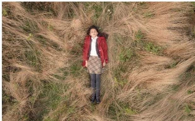
Fig 37 91