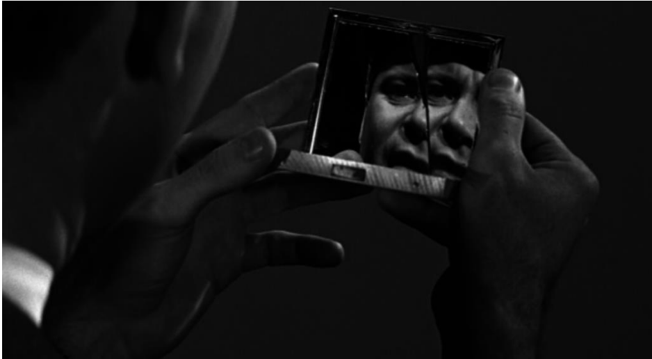
Fig.2 The Apartment . The Mirisch Company, 1960. Dir. Billy Wilder

In an over-the-shoulder medium shot, his bemused eyes continue to look at Fran while he answers the phone. After a lovers' quarrel, alone and miserable in Baxter's apartment on Christmas Eve, she decides to commit suicide by ingesting a bottle of sleeping pills. Enlisting the help of his neighbour doctor and his outspoken wife, the clerk manages to save Fran and get her in shape. They get their Hollywood ending, when, on New Year's Eve, she realizes that her place is by Baxter's side. Fran's depression may have been downplayed, but her suicide attempt introduced then-audiences to the uncomfortable reality of the overdose.