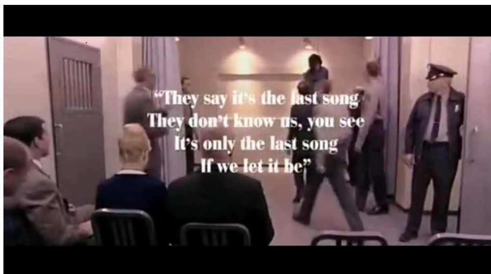
Fig.19 Dancer in the Dark . i.a. Zentropa Entertainments, Trust Film Svenska, 2000. Dir. Lars von Trier