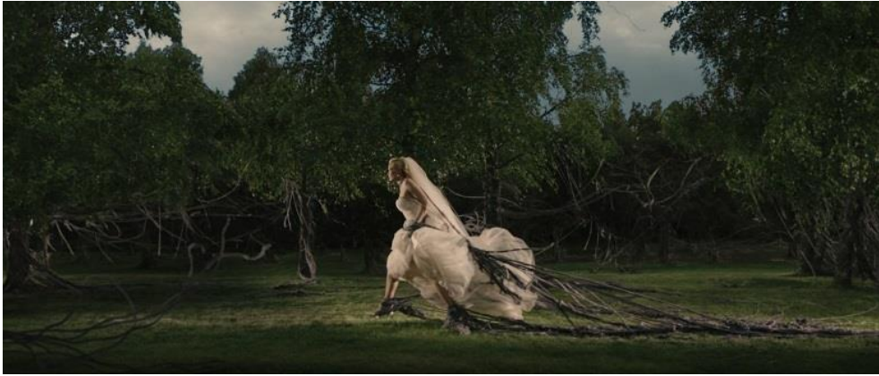
Fig. 28 78

The sisters' close relationship allows them to tell each other uncomfortable truths. Justine knows that Claire doesn't like to hear her complain, and in return, the latter reproaches the bride for her fake smile and her marital neglect.