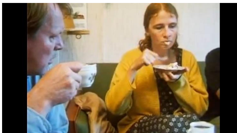
Fig.18 Idioterne . i.a. Zentropa Entertainments, Danmarks Radio(DR), 1998. Dir. Lars von Trier

uncomfortable. In the first case, facial close-ups register the characters' embarrassment. They also signal the dismantling of their romantic view on mental illness that will eventually lead to the group's dissolution. As von Trier specifies, the film "(...) juggles with the concept of normalcy, with the way we ought to and ought not to behave. And if one devalues rationality, the world tends to fall apart" (Knudsen, 1998). Because of its pornographic imagery, the bacchanalia scene can be seen as uncomfortable. However, a contrast cut to intimate shots between two of the characters, Josephine (Louise Mieritz) and Jeppe (Nikolaj Lie Kaas), renders it bitterly artificial. The last sequence films Karen's tribute to the collective's dying ideal. By spassing in front of her family, she sacrifices the possibility of a reconciliation.