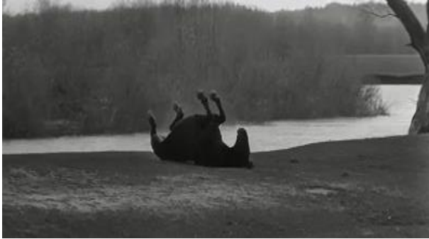
Fig.8 Andrei Rublev . Mosfilm, 1966. Dir. Andrei Tarkovsky

prompts an analogy with the detective's own anamnestic incursion. It signals the danger of sinking into the depths of one's mind to retrieve painful memories, leaving behind the safe confines of reality. This long take debuting Fisher's story can be interpreted as a metaphor for the detective's wrecked psyche of which only the unconscious is aware.