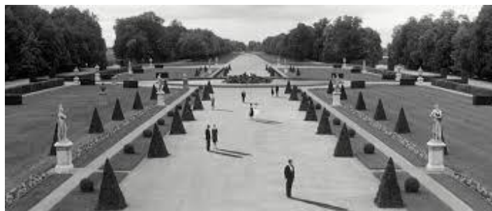
Fig.26 Last Year at Marienbad . i.a. Cocinor, Terra Film, 1961. Dir. Alain Resnais

Over the course of the movie, the illusory control the characters value, appears all the more futile in the face of imminent disaster.