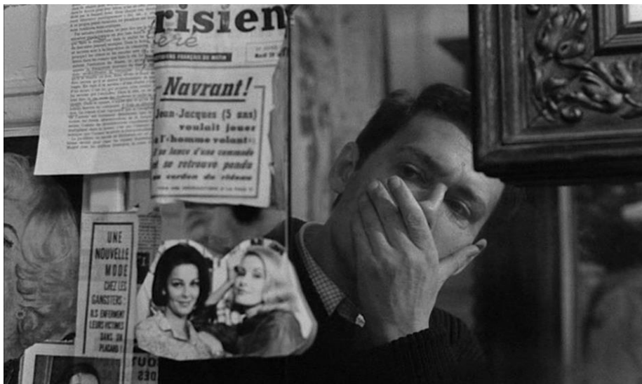
Fig.3 Le feu follet . Nouvelles Éditions de Films, 1963. Dir. Louis Malle

the fear of living, but rather the fear of not being able to discover the meaning of life. This search is at the core of his depression. His perpetual unhappiness is the reason for his addiction, something that he admits to his doctor. When the latter claims that “life is good” and Alain’s cure is “a matter of willpower”, the former, perplexed, cannot understand how the psychiatrist failed to see the issue: “le mal est au coeur de ma volonté.” 6 After all, he demonstrates decisiveness when he plans to take his life. His room can be seen as a metaphor for introspection. There are excerpts of newspaper articles, books and pictures on the walls. Through point of view shots and close-ups, we can follow his gaze tuned to his repetitive interior monologue. Alain walks between the four walls like walking within himself.