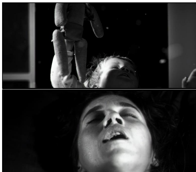
Fig.20 Antichrist . i.a. Zentropa Entertainments, Zentropa International Köln, 2009. Dir. Lars von Trier