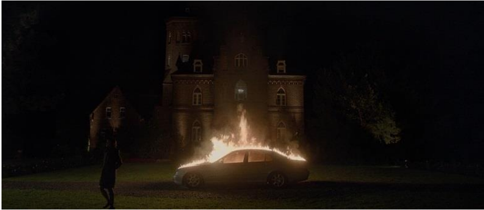
Fig. 40 94