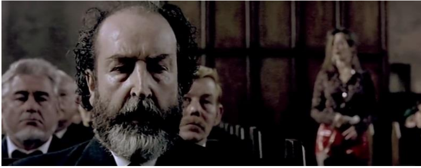
Fig. 17 59

In the Epilogue, the tableau of a river flowing towards the light and the aerial shot of the bells of heaven, miraculously heard by Jan and his co-workers, are metaphors for Bess' beatification.