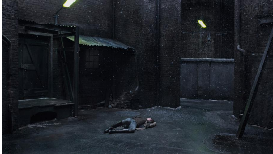
Fig.33 Nymphomaniac vol.1 . i.a. Zentropa Entertainments, Heimatfilm, 2013. Dir. Lars von Trier

hand. Still, the camera refuses to show to whom it belongs. Instead, it chooses to zoom in slowly into the darkness of an air vent nearby. Industrial rock music jolts one from suspense, as the wide shot of a beaten woman lying in alley comes in view.