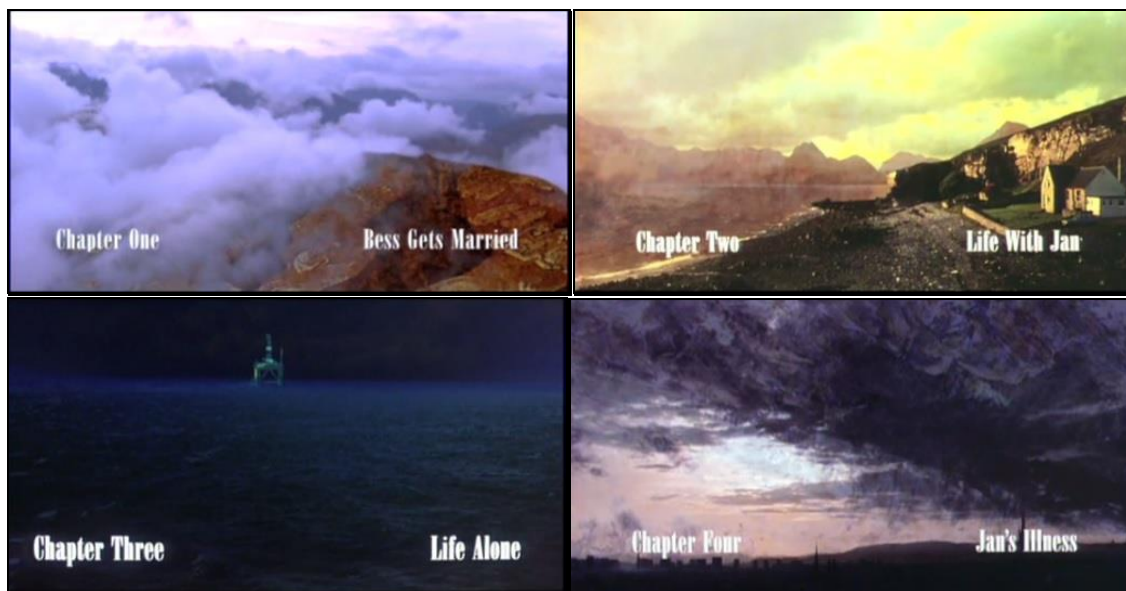
Fig.15 Breaking the Waves . i.a. Argus Film Produktie, Zentropa Entertainments, 1996. Dir. Lars von Trier

Breaking the Waves is the story of Bess (Emma Watson), an impulsive, naïve and devout young woman whose straight-forwardness, simplicity and tendencies to deviate from the norm of her patriarchal society, are perceived as signs of mental weakness. Her marriage to Jan (Stellan Skarsgaard), an oil platform worker and an outsider, renders her unpopular in the eyes of the tyrannical elders, the pillars of the somewhat isolated community. She dedicates herself body and soul to her husband, impatiently awaiting and praying for his return from the sea. When a work-related accident leaves Jan bedridden with little hope for recovery, Bess becomes convinced that her husband's misfortunes are the consequence of her ardent plea with divinity to bring him home. Willing to do anything to save him, she agrees listlessly to a miserable Jan's deranged demand to commit adultery and report back: "it will feel like me and you being together again. Now that, that will keep me alive." With the conviction of a martyr, Bess launches into a series of affairs that gradually drain her of energy and lead to the young woman's untimely, savage death. Her beliefs prove strong enough to cure Jan, and redeem her soul. Von Trier's mise-en-scène conveys in a clearly constructed manner the moral dimension of the physical and mental traumas Bess experience. The narrative is divided into seven chapters bearing conspicuous names, and introductory tableaus.