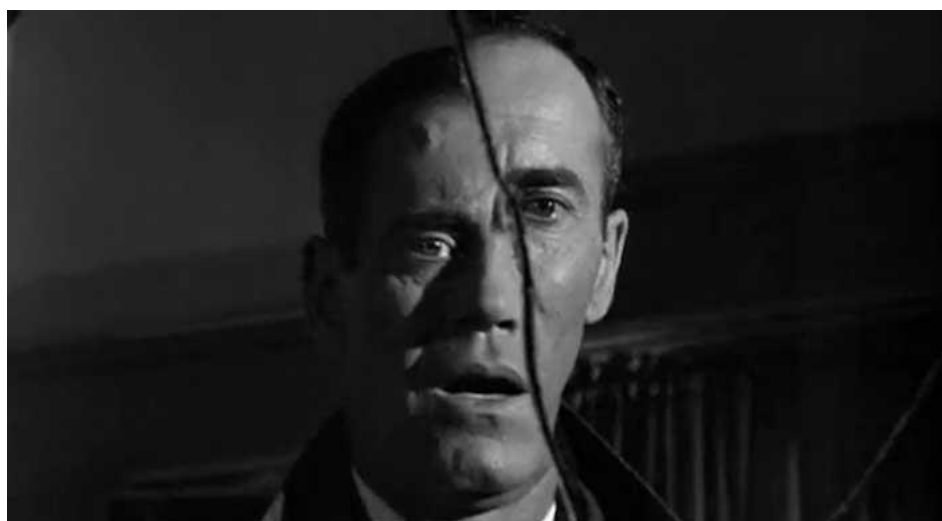
Fig.1 The Wrong Man . Warner Bros., 1956. Dir. Alfred Hitchcock

family and particularly, on his wife, Rose (Vera Miles). The director chooses to show the progress of her illness by employing aesthetics pertaining to madness rather than depression. This can be interpreted as a hint towards the danger of untreated depression. At first, dismay sets in. As the character loses all hope, she begins expressing her pessimistic view of the future in a detached, almost catatonic manner. Her facial immobility and her lost, wandering gaze appear to be depressive. Further on, she convinces herself that her husband's bad luck is her own fault. Her guilt obsession gives way to paranoid thoughts about the world as the enemy. Her anxieties reach critical level and throw her into a delirious state of mind during which she hits her husband with a hairbrush. A close-up of the husband's face cuts to a shot of its reflection in a broken mirror and back to Rose's perplexed face.