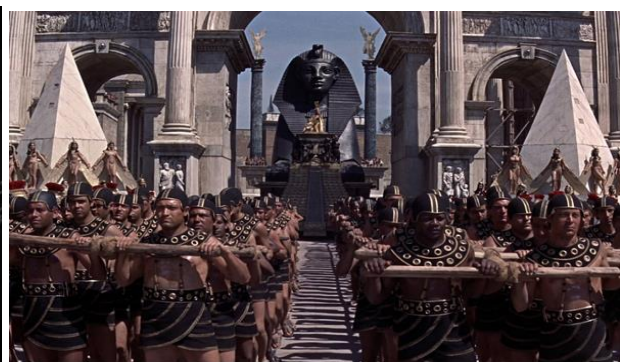
Fig.14 Cleopatra . i.a. Twentieth Century Fox Film Corp., MCL Films S.A., 1963. Dir. Joseph L. Mankiewicz