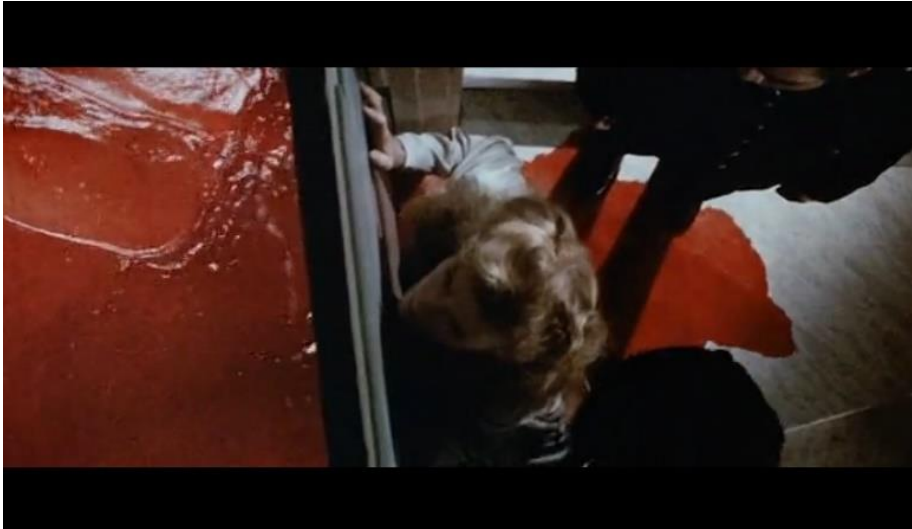
Fig.12 Europa . i.a. Alicéleo, Det Danske Filminstitut, 1991. Dir. Lars von Trier

Some of the aesthetic components are used to convey the ridicule of certain situations. The scene of Leopold's enrolment in the company filmed in wide shot, shows him being stripped, measured and weighed with mechanical gestures, in a manner reminiscent of the registering of prisoners in concentration camps. Another vivid image is that of child-workers listlessly dragging the heavy train from the depot which parodies the very wide shots of slaves in Hollywood epic dramas.