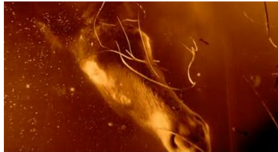
Fig.9; Fig.10 The Element of Crime . Det Danske Filminstitut, Per Holst Filmproduktion, 1984. Dir. Lars von Trier

As the character's voice-over echoes the portentous words of Coleridge's poem 53 "water, water everywhere and not a drop to drink", one finds out that his state of mind is merely mirroring the general one. The water which surrounds him, represents the medium that sustains the vicious flow of corpses and decaying matter. Its ubiquitous presence nurtures the disease that creeps in through the cracks of Osbourne's house, dirty hotels, tunnels and abandoned administrative buildings. The light suffers an equal degradation, from the calm, bluish hues of the initial scenes,