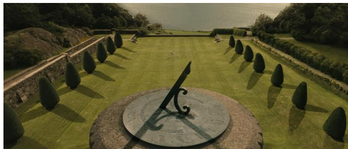
Fig.25 Melancholia . i.a. Zentropa Entertainments, Memphis Film, 2011. Dir. Lars von Trier

portentous visuals introduce Justine (Kirsten Dunst), the main character of von Trier’s romantic ode to melancholy, whose sufferance gifts her with an unusual philosophic clarity over the meaninglessness of being and the end of the world. The soft music lulls the viewer into the next extreme-wide shot. It shows the sumptuous garden of a château with symmetrically trimmed bushes on each side of the lawn overlooking the sea, where the barely-visible silhouettes of a woman and a child are playfully spinning clockwise. In the foreground, a sundial looms over the whole scenery. The imagery is reminiscent of Resnais’ Last Year at Marienbad (1961). It prefigures the anthropological aspect of Melancholia since, like its’ classic reference, it appears as “the setting in which human behaviour could be observed” (Ebert, 1999).