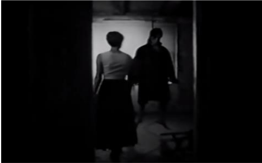
Fig.6 Orkidégartneren. Filmgruppe 16, Lars von Trier, 1977. Dir. Lars von Trier