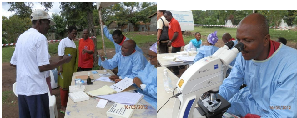
Figure 4: Field laboratory during the survey (picture taken during the field activities)