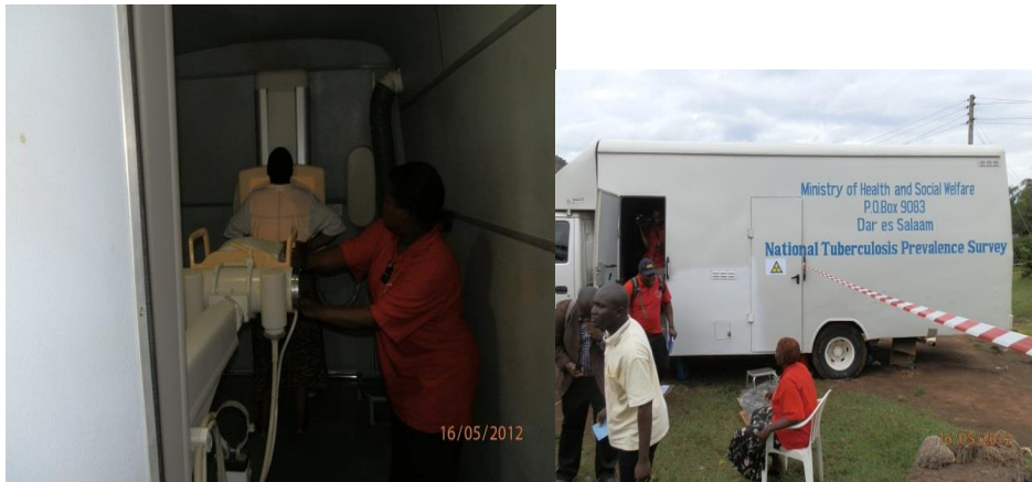
Figure 3: X-ray screening during the survey (picture taken during the field activities)