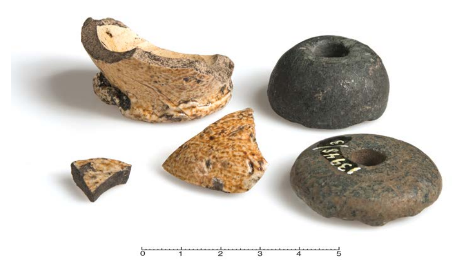
Figure 7. Three shards of a stone ware beaker and two dark green serpentine diabase spindle whorls from Storsetehilleren (B13948/3, 7, 12 and 21, B6577)

Archaeologist Bjørn Ringstad interprets the shelter as a short-term dwelling site, probably a shieling, connected to the local farm, from which the tending of sheep/goats and cattle was carried out and hunting and fishing expeditions were organised (Ringstad 1985). The inventory shows that miscellaneous productive activities took place at Storsetehilleren, among other yarn was spun. The presence of crafting and maintenance tools, as well as pottery and