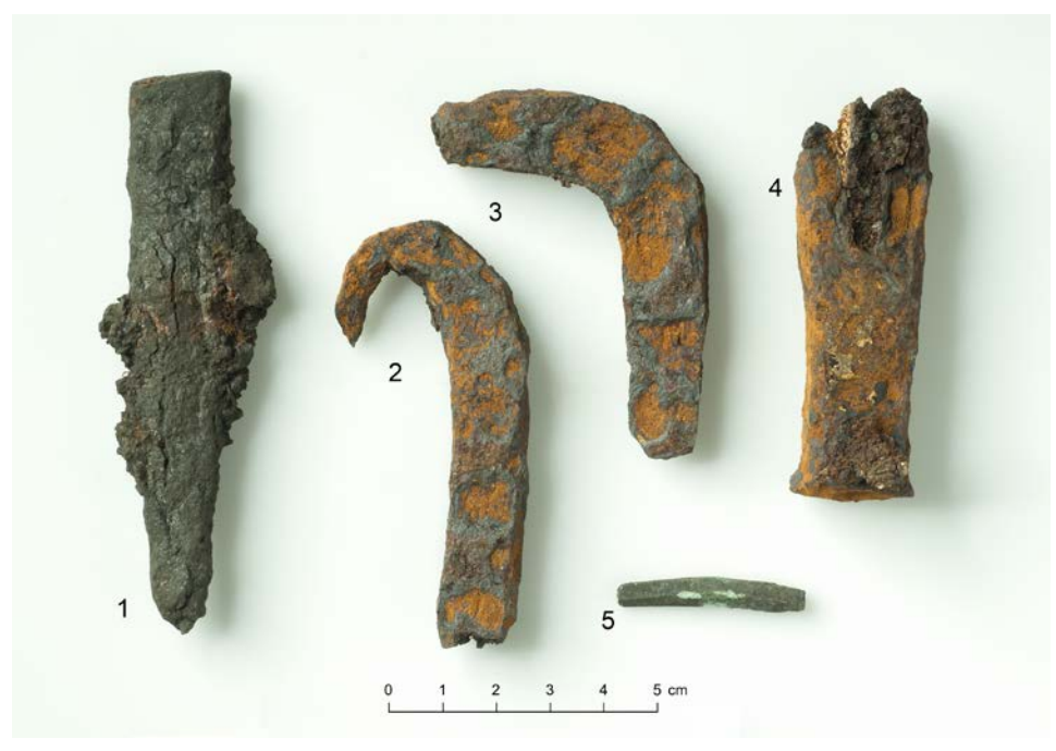
Figure 10. Hallgrimshelleren. Early modern period metal artefacts: 1. Iron point. 2. Iron hook. 3. Bended piece of iron 4. Iron hammer-head. 5. Bar of copper

iron nail and a few iron fragments. In the earliest phase, culture layers are also characterised by a large amount of charcoal, slag, some shell and bone. Compared to the oldest phase, large amounts of iron slag were retrieved. Other artefacts were bead-shaped hammerscales and several iron tools: a hammer-head, two chisels, a possible knife, a 'possible tool' and a hone (Figure 10). A relatively large number of undetermined pieces of iron and a few pieces of bronze/copper – a small bar (1.4 g) and small pieces of sheet metal – were also found. Finally, shards of pottery with traces of charcoal on the outside, a soapstone vessel, as well as one piece of red deer antler production waste were retrieved. The antler piece was a shed burr and may well have been from a red deer hunted locally.