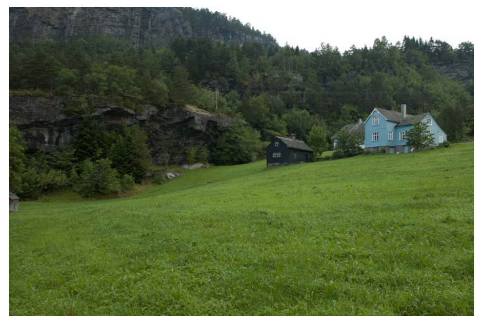
Figure 8. The rockshelter Hallgrimshelleren at the Sævarhagen farm in the village Herand