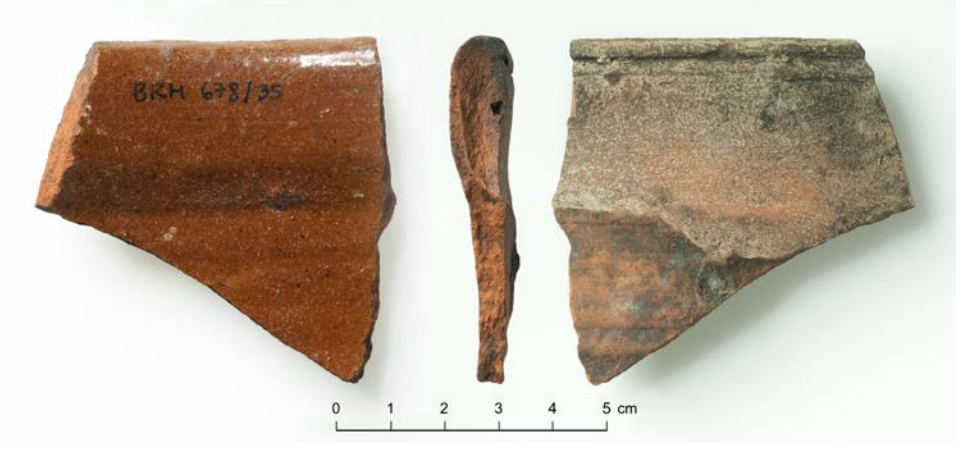
Figure 9. Hallgrimshelleren. Early modern period red ware pottery