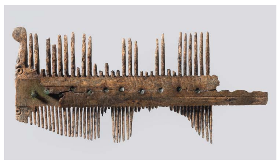
Figure 5. Brasehidleren. Medieval double composite bone/antler comb (S7863a)

The shelter at Brasehidleren is situated by the ford Høgsfjorden in pasture land in the outfield, c. 2,500 m from the agrarian settlement and at around 200 masl. Data on the size of the shelter is not available and there are no C14-dates from the site. It has been test-pit surveyed (Storvik 2011). A double composite antler or bone comb of type D3 (typology according to Wiberg 1977; Flodin 1989), places the activity safely within the high medieval period as judged against similar material from Bergen (Fig. 5). In addition to the comb, a square bronze fitting, a spindle whorl, and a whetstone were found. The whorl shows that spinning took place in the shelter, the hone points to miscellaneous production or maintenance of tools. The objects indicate that the users of the shelter had organised themselves for a stay of some duration. Spinning whorls and hones are common at excavated (surface) shieling-sites from the Viking Age and earlier periods as well (Bjørgo et al. 1992, 305). In more recent history, spinning was also an important additional activity during the summer occupations of shielings (Reinton 1955, 315). Based on the sparse data, it may tentatively be suggested that the shelter mainly functioned as a short-term seasonally-used dwelling site, possibly a shieling where secondary activities such as spinning and tending to tools took place alongside tending to animals.