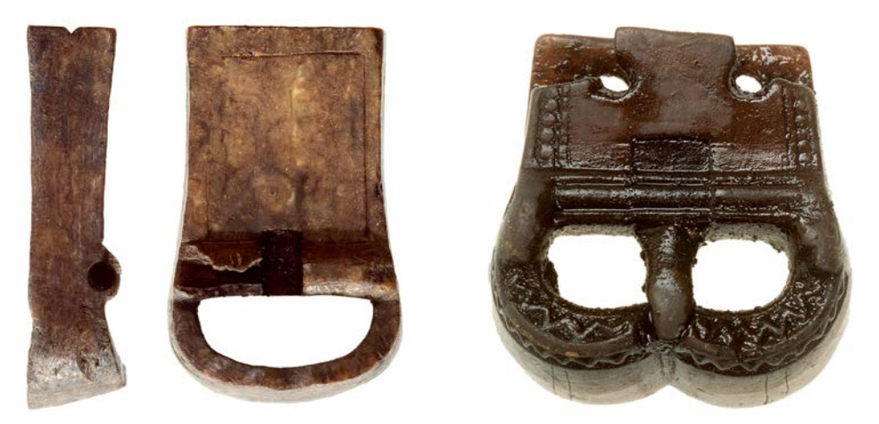
Figure 1. Two belt-buckles of walrus ivory from Ø34, in the Eastern Settlement, Greenland. Left: Broken and discarded rough-out seen from above and from the side. Length 4.4 cm, width 2.8 cm. Right: Ornamented buckle broken at the end of the plate where the belt would be fastened. Length 2.6 cm, width 2.6 cm. (Photos: National Museum of Denmark).