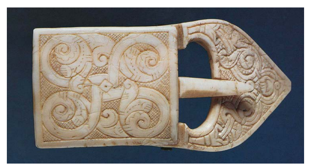
Figure 2. Belt-buckle of walrus ivory from the Isle of Lewis, Outer Hebrides, Scotland. Length 6.1 cm. Found in 1831 as part of the 'Lewis chessmen hoard'.