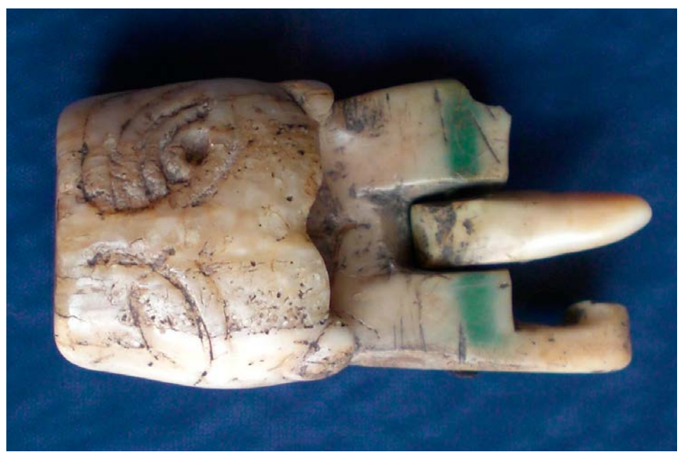
Figure 4. Belt-buckle of walrus ivory from Brattingsborg, Samsø, Denmark. Length 4 cm; width 2.05 cm. (Photo: Vivian Etting).