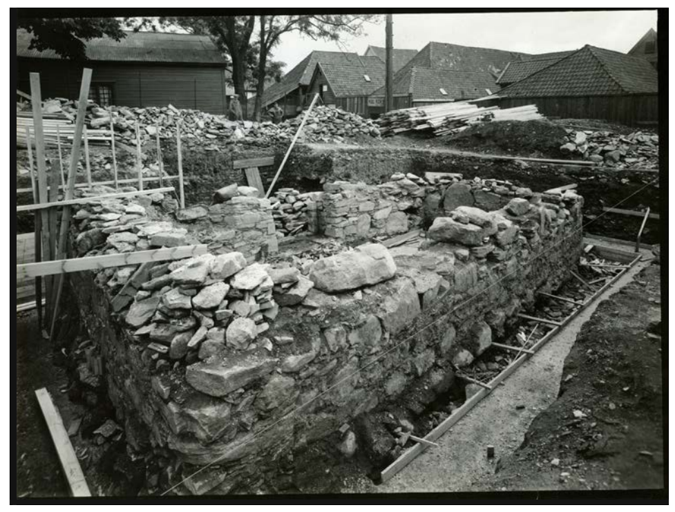
Figure 2. Photo of Building A after excavation in 1935, seen towards the southeast. The portal in the east wall is well visible, and to the left of it one of the two window niches flanking the portal. In the background some of the Bryggen tenements.

In 1935, the site southeast of St Mary's Church was excavated by Koren Wiberg in order to erect the Schøtstuene complex. During the work the ruin of a medieval stone house was found c. 50m from the church (Building A) (cf. Fig. 1, no. 4). It was summarily excavated by Koren Wiberg and enclosed inside a concrete cellar beneath the Dramshusen Schøtstue. The house was originally built above ground with a 1.2m wide doorway and two narrow windows in the east wall (Fig. 2). The ground floor consists of a single room with c. 1.0m thick walls, externally measuring 10.3 x 5.5 m and internally c. 8.0 x 3.8 m (30.4 m<sup>2</sup>), and without a fireplace (Melle 2011).