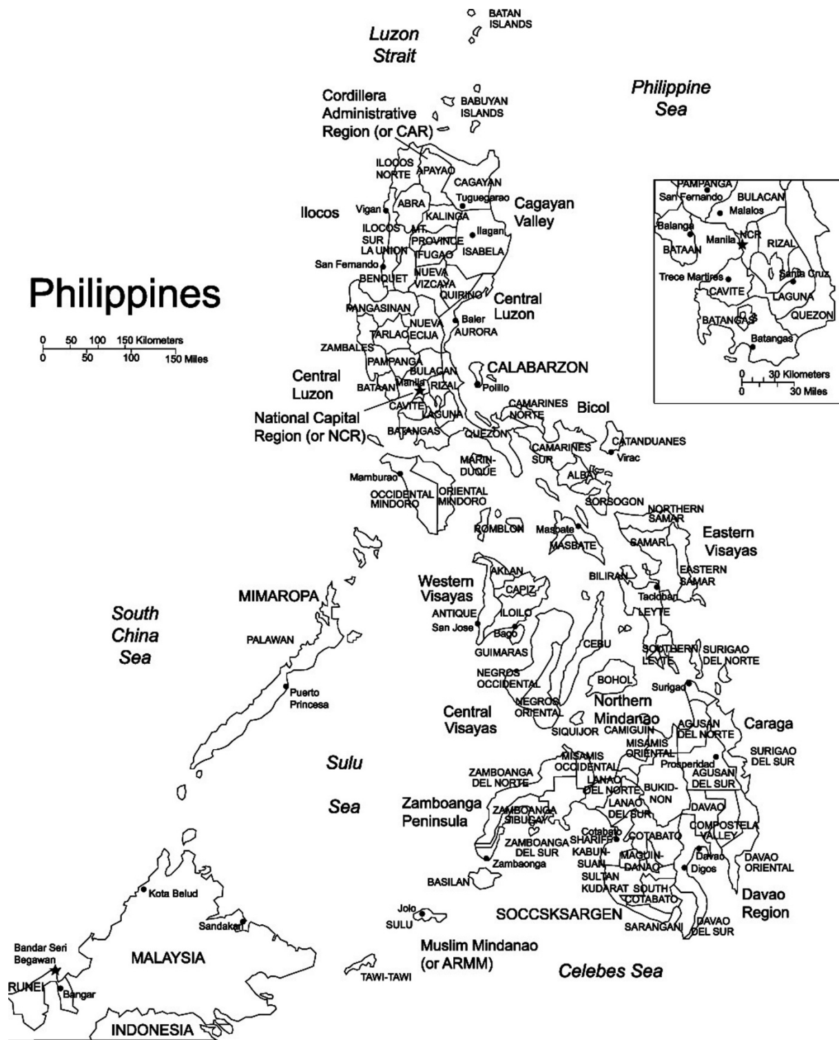
Figure 1: Map of the Philippines