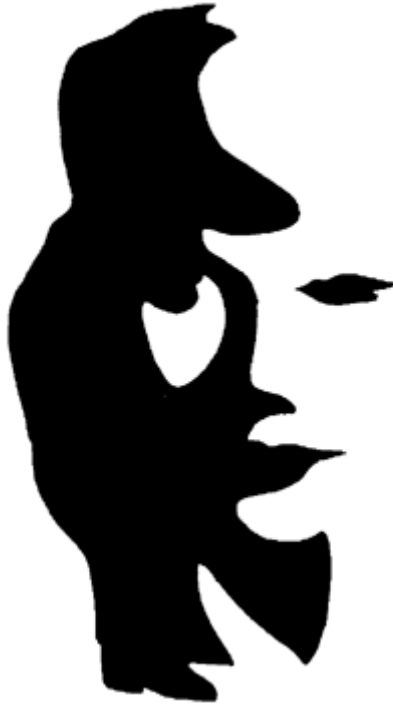
Figure 1: demonstration of a perceptual set.

What one sees in this picture is influenced by what one expects to see. From a cognitive perspective, our readiness to perceive something based on our expectations is referred to as a ‘perceptual set’ (Passer & Smith, 2011). Figure 1 could be seen as either a woman’s face, or a saxophone player. Even though the picture itself does not change based on our expectations, our experience of it will. Indeed, Kirsch has argued that “what we experience at any given time is a joint function of the stimuli to which we are exposed and our beliefs and expectations about those stimuli” (Kirsch & Low, 2013, as cited in Wampold & Imel, 2015, p. 205). I see this as linked to the notion proposed by the philosophers of existential hermeneutics, that every experience necessitates a preunderstanding (Alvesson & Sköldbberg, 2009); we always experience something as something .