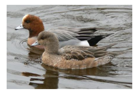
Figure 1. Anas penelope, female in front. (Photo: Katie Fuller) Wikipedia Comm.

. Adaptive strategies of Eurasian Wiegon, ( A. penelope ) show that the birds used food from both terrestrial and lacustrine habitats from 9<sup>th</sup> April to 2<sup>nd</sup> June 1983 (Jacobsen 1986). For other birds more time consuming macro studies are made showing a change during springtime from for instance Betula catkins, available shoots and winter-green parts of different Ericales followed by different, mostly undefined herbs. The potential importance of pollen and flowers of herbs with nutrient-rich content, like nectar, has hardly with some exceptions, been discussed (Moe & Bjune 2009). The selective use of field observations and macro-remains studies seem to exclude important information about bird feeding. In the studied period the bird feed themselves on both on both terrestrial and submerged plants, in addition to for instance insects.