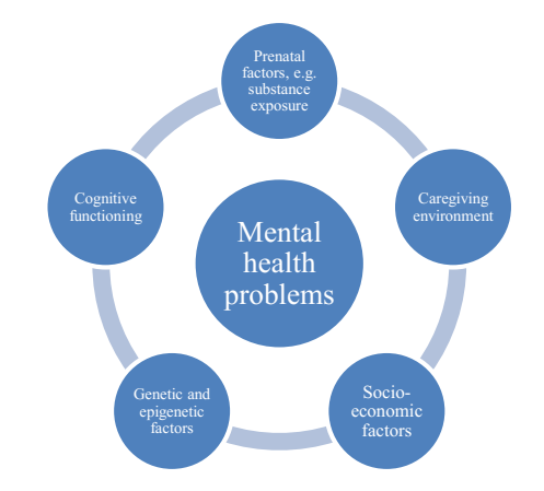
Figure 2. Possible associated and interacting risk factors related to mental health problems.

In summary, earlier research suggest that children prenatally exposed to alcohol and other substances are likely to be more vulnerable to developing mental health problems, with several associated risk factors which can be either cumulative and/or interacting (83, 93) (see Figure 2). For substances other than alcohol, results are more conflicting. It is possible that risk factors in the caregiving environment may have a greater impact on a child's development than prenatal substance exposure itself (83, 93). However, it is also possible that prenatal substance exposure affects neurodevelopment, and consequently the child's vulnerability to environmental factors. A possible cumulative effect of biological and environmental factors has been postulated (83, 94).