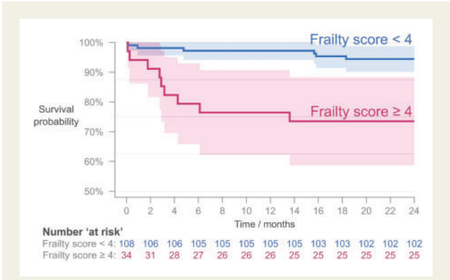
Figure 3 Kaplan–Meier plot of 2 years survival after transcatheter aortic valve implantation (n = 142). The coloured bands indicate 95% confidence intervals.