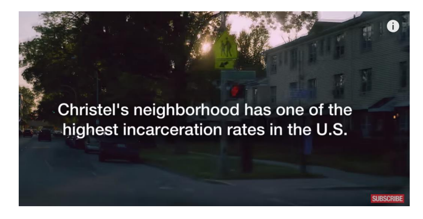
Figure 4.4: Written information provided about Christel's neighborhood (0:35)

As West (2014) states, sound is used to warn or attract us, the use of music in the analyzed excerpt illustrates this claim. For instance, in the combination of the blue lights and the sound of the police sirens, the visual and the audio designs communicate that an incident has happened. In combination with the following information provided by written language (figure 4.4), the intense music, visual image of blue sirens, and the sound of the police sirens emphasize the use of pathos as it appeals to negative emotions such as fear.