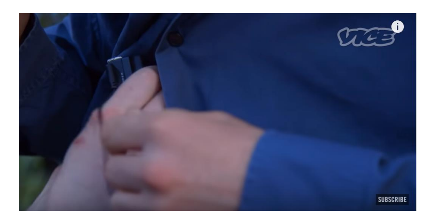
Figure 4.14: Ben is wired and prepares to go undercover (1:09)