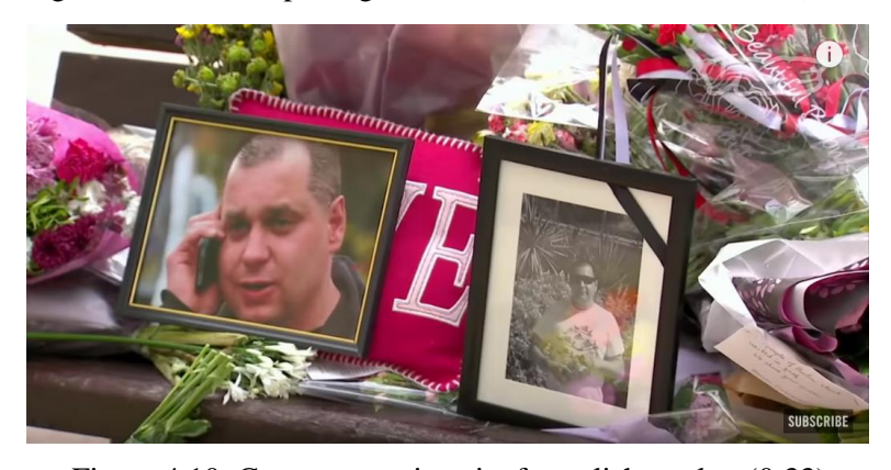
Figure 4.10: Commemoration site for polish worker (0:33)