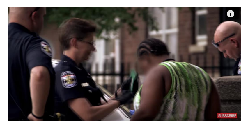
Figure 4.7: African American woman investigated by the police screenshot 2 (1:20)

Table 4.5 illustrates that gestural design can make meaning by itself, but in interaction with other communicative modes it is more apparent to the viewer what the gestural movement indicates. Bezemer (2014) states that the gestural affordance plays an important role, where one gesture alone might mean a lot of different things compared to another. Step two will examine how gestural movements together with the other modes use the means of persuasion to make meaning and affect the viewer.