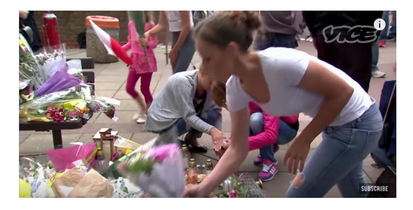
Figure 4.9: Woman putting down flowers, commemoration (0:32)

Table 4.6 illustrates how the different modes are used for meaning-making. With an emphasis on the spatial design and the combination of different visual images and actions, the issue of migrant workers in Brexit Britain is communicated. For example, as illustrated in figure 4.9, as the woman puts flowers on the commemoration site, and the news journalist says, " Two polish workers were assaulted by gang abuse " (0:32), followed by pictures of the man who died (figure 4.10), and the flowers and note on the site, emphasize how spatial design are used for meaning-making.