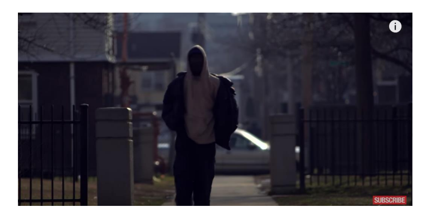
Figure 4.8: A young man walking around the community (1:22)

Another example of the means of persuasions is the composition of a young man walking in the streets (figure 4.8). The young man in the screenshot is dressed in baggy clothes, and it is not easy to identify him; the young man could be anyone. As the picture of the young man is shown in the video, Prof. Alexander says "It sends this message that whether you follow the rules, or you do not (...) you are going to JAIL". The emphasis on the word "jail" emphasizes the incarceration issue, and together with the depiction of the young man, and Prof. Alexander's statements indicate that anyone in these communities will most likely end up in jail. The use of logos (facts) in combination with negatively loaded words such as jail appeals to emotions.